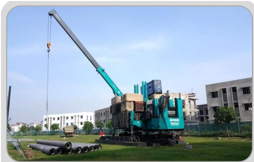
Aug 2017 - Finished Piling Phase 2