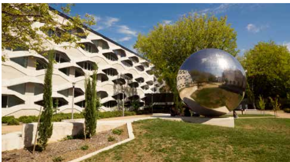
Australian National University – Canberra

You should carefully check student visa information on both the Department of Immigration and Border Protection ( www.border.gov.au ) and the institution websites for English language requirements.