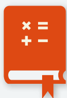
Engineering & Technology