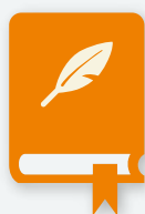
Arts & Humanities

Australian universities feature in the top 50 ranked universities in the world in the following study areas: