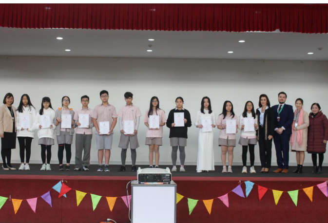
Our students received awards for excellent work in the Vietnamese program