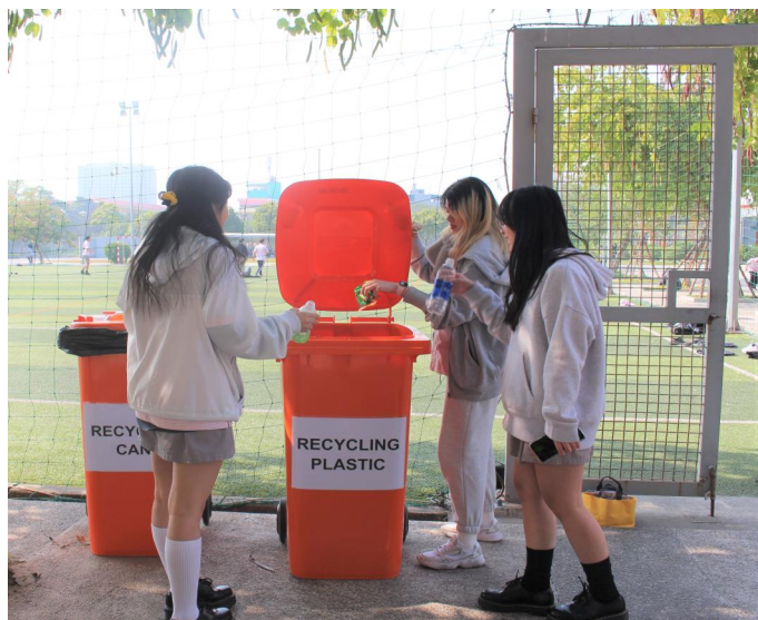
Recycling is important