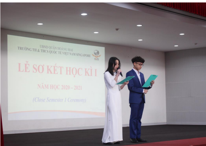
The end of Semester Vietnamese Assembly