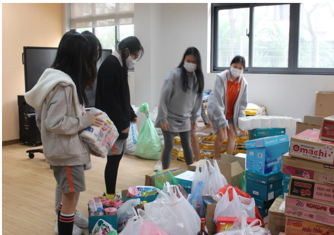
Many donations have been received from our wonderful parents