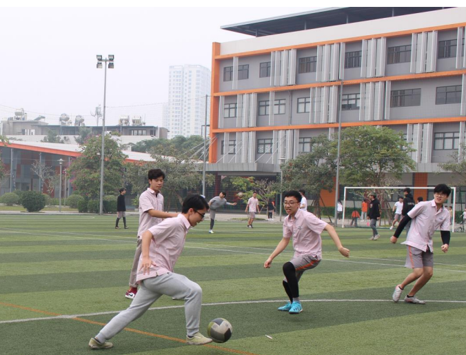
Our students enjoy the inter-house football matches during lunch time