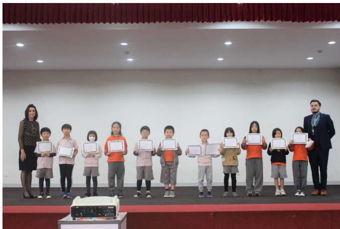
Primary school students receiving their Semester 1 merit awards