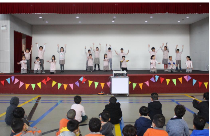
Students always amaze us with their talents