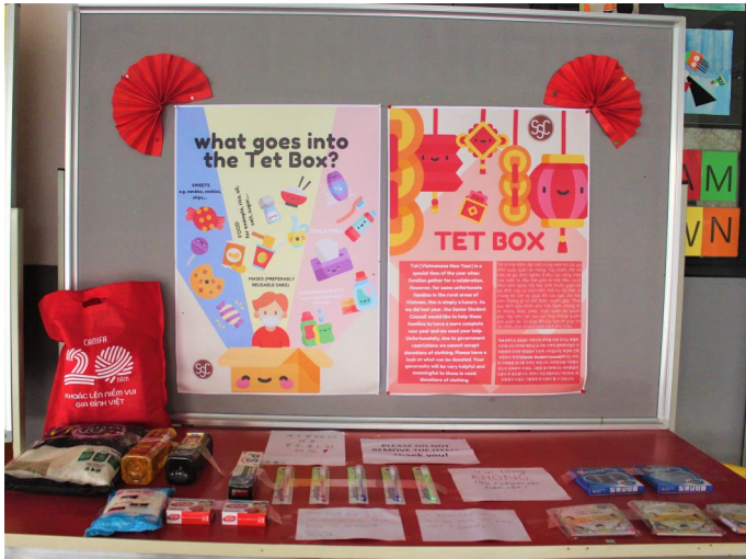
Student Council collected items for TET to donate to the less privileged.