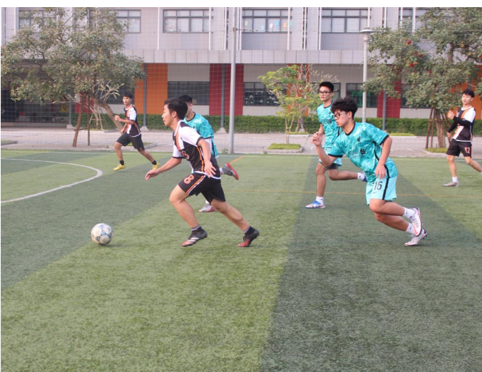
The SIS football team won their matches against Vietnam-Australia International School