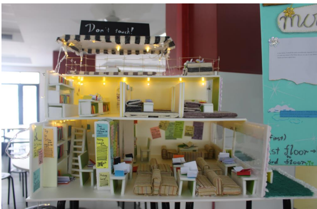
Such amazing projects were displayed