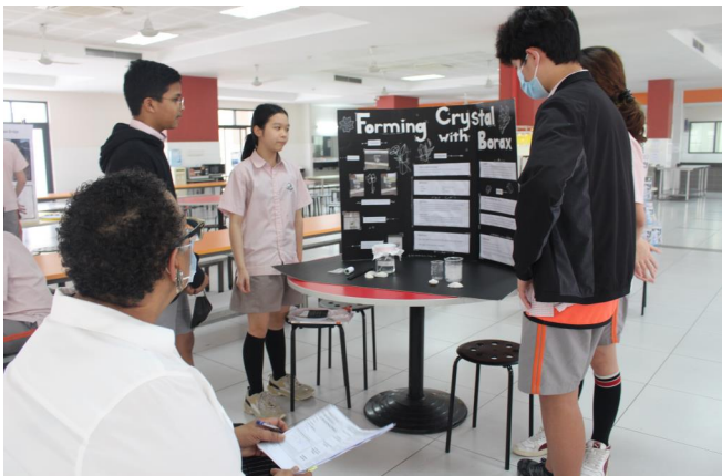
The Gallery Walk was enjoyed by all