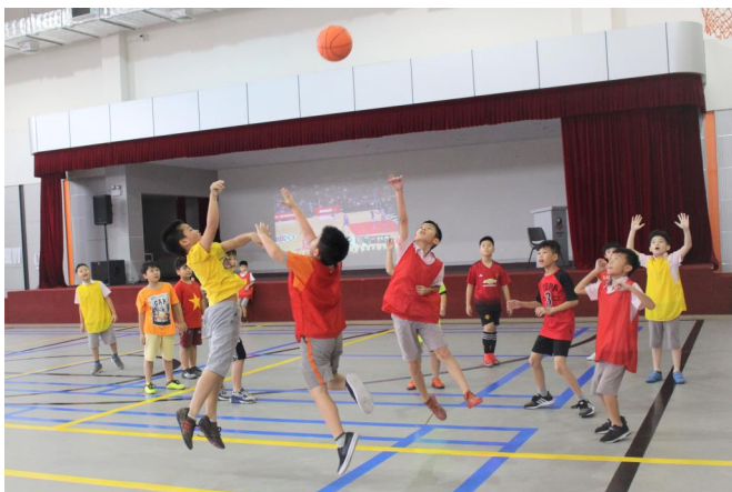
A tough game of basketball