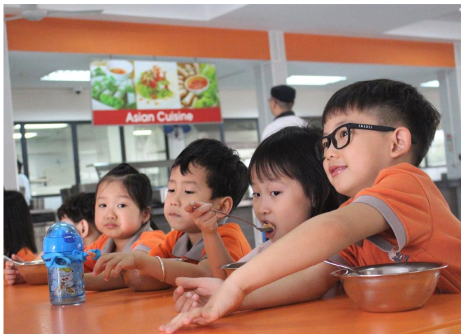
Other KinderWorld International Kindergarten sent over their Prep students for a day visit.