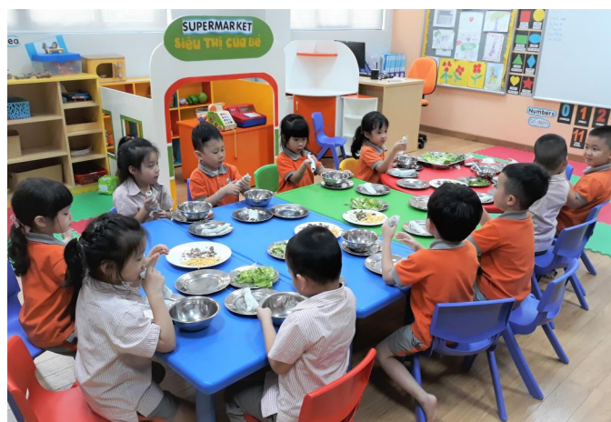
KIK students making Pho roll

Specifically, we would like to start with the Korean language so that students have access to free-reading material until we are able to purchase Korean titles for next year. Donated books will be cataloged into the library system for regular checkout by students. The books will also have “donated by” information. Books can be dropped off to the front office, or your child can give the books to their form teacher.