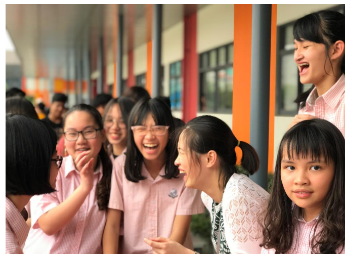
Our grade 7 integrated students and their form teacher having a great time!