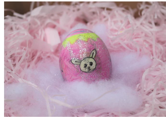
Easter Egg 1st Place: : Jung You Jin of 6LA