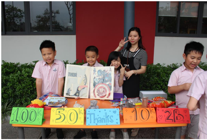
Other classes offered games to be played and prizes to be won for their stall