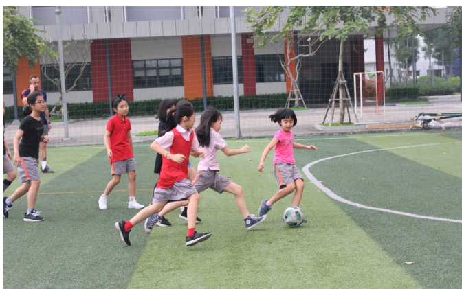
Even the girls get to join in with the soccer games.