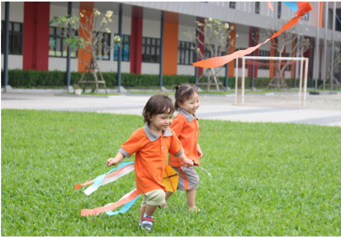
Our KIK students enjoying some outdoor learning. Flying kites is a good fun