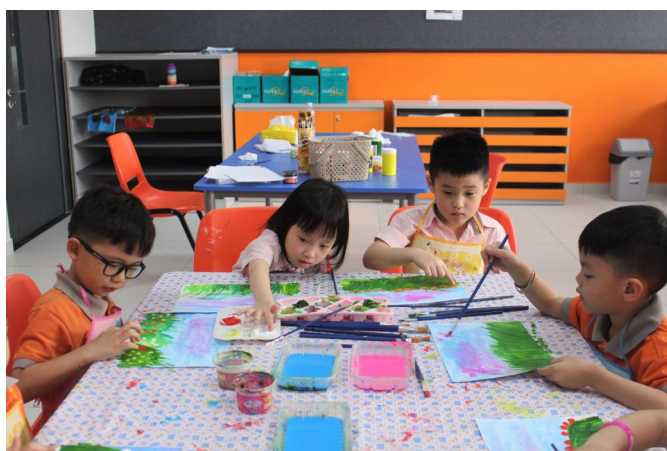
More of Prep students experiencing an art lesson in our new Building C

Every year, in June, our students and teachers take gifts to the wounded soldiers at the Center for Disabled War Veteran in Ha Nam, they were wounded during the French and American War. These people devoted their youth and blood for Independence, Freedom, and Peace of Vietnam. This year we do hope that we will continue to receive your support for this important activity.