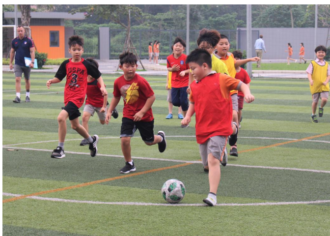
A friendly game of soccer between the SIS schools