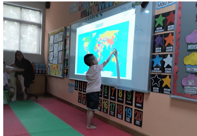
Our KIK students have been expanding their knowledge about our earth