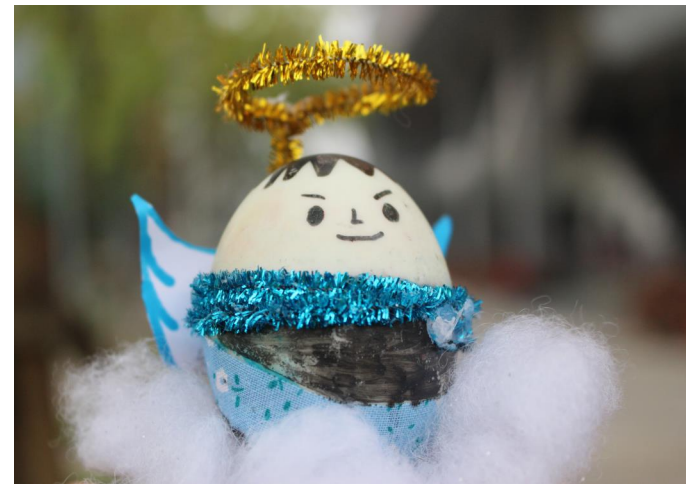
Easter Egg 2nd Place: Kang Dae Hoon of 6LA;