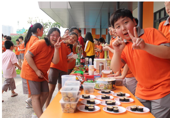
Many of our students stalls had delicious food for sale!

To honour all the native languages SIS students speak, we are starting a donated books lending library. This term, we are looking for students to donate books they have read to the Primary or Secondary libraries.