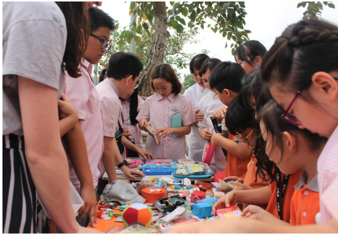
Students buying and selling goods at our SIS Flea Market