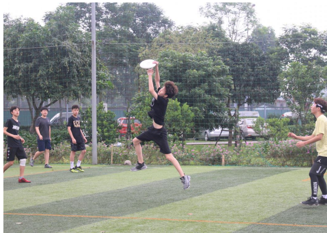
Ultimate Frisbee is ultimate fun!