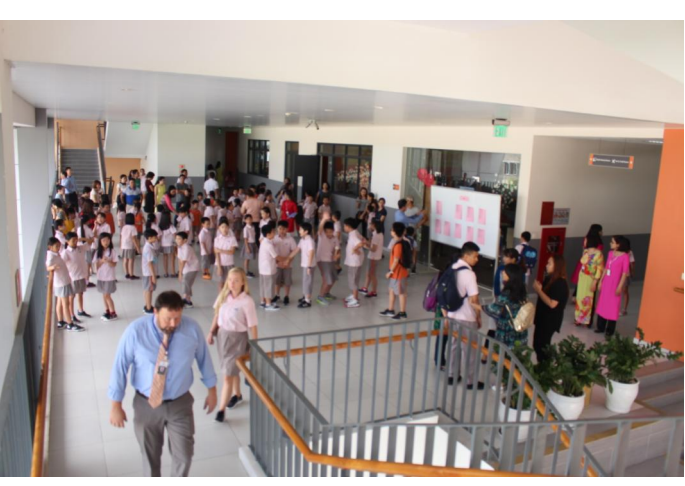
Primary students finding their class information