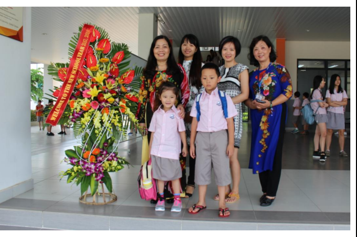
First day at school with teachers, parents and students

Gamuda Gardens 2 Road, Gamuda Gardens, Km 4.4 Phap Van, Hoang Mai District, Hanoi City Tel: (84-4) 66661818 Fax: (84-4) 62620639