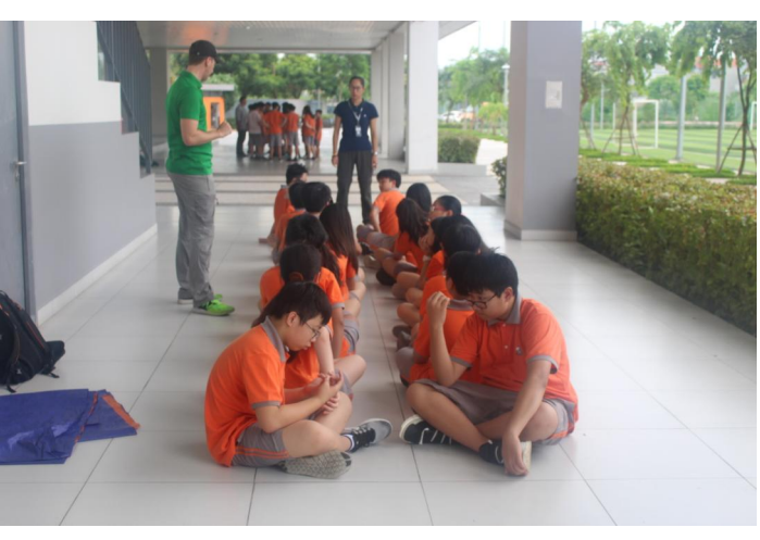
Outward Bound activity