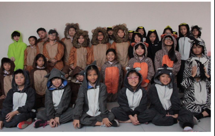
3A and 4A in their Concert costume