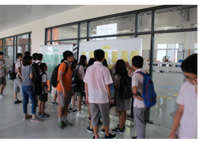
Secondary and High school students finding their class information