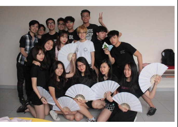
GAC and A Level's performance