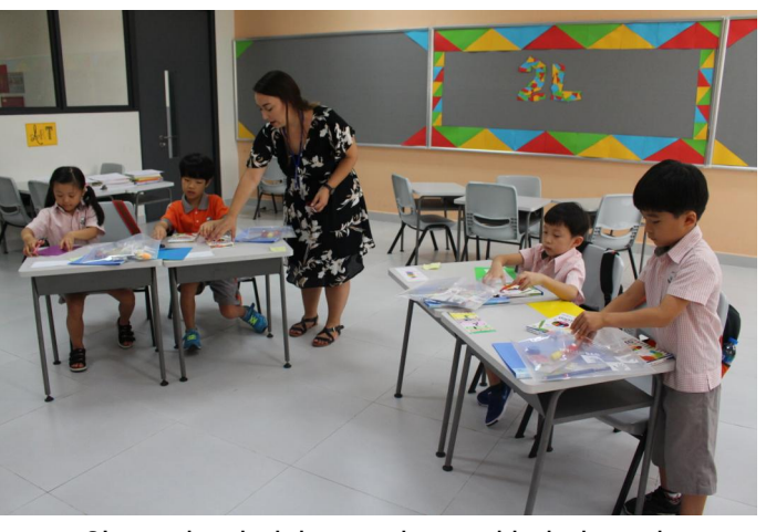
2L teacher helping students with their work