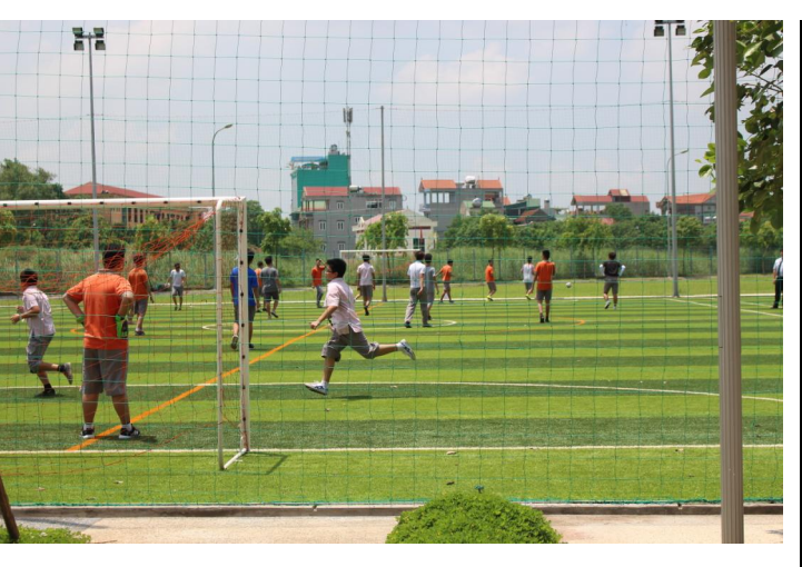
Students using football pitch during break