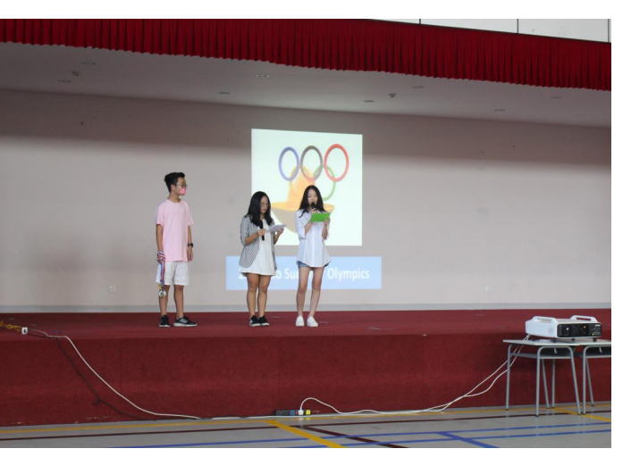
8LB presenting on assembly