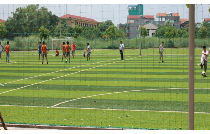
Upgraded Football Pitch

Gamuda Gardens 2 Road, Gamuda Gardens, Km 4.4 Phap Van, Hoang Mai District, Hanoi City Tel: (84-4) 66661818 Fax: (84-4) 62620639