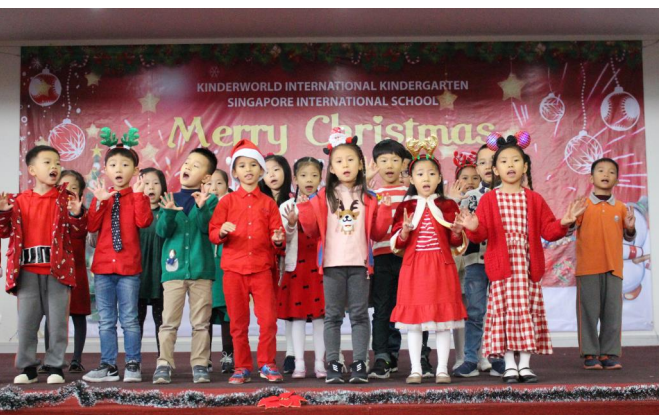
Students enjoyed singing in the Christmas Concert.