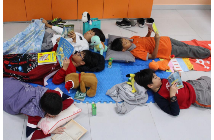
Snuggle up and read time.