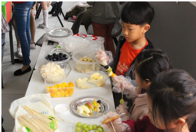
Students made their own fruit sticks