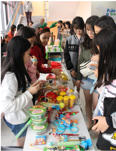
Food was a great hit and enjoyed by many.