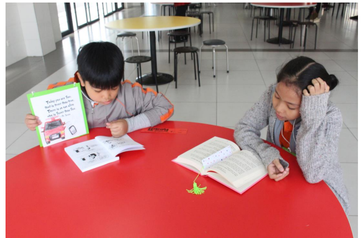
SIS Reading Week was a huge success