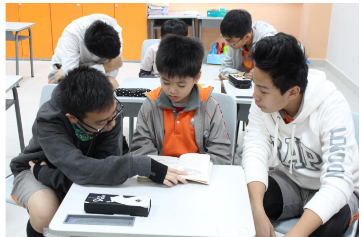
The students love the interaction and reading time together.