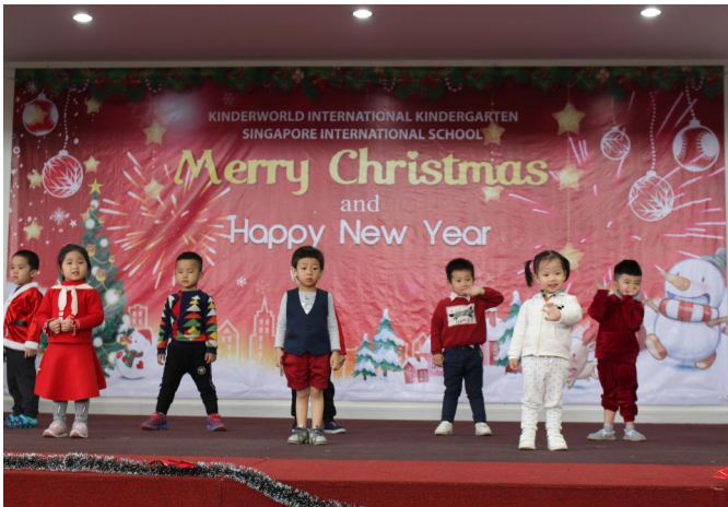
Our KIK students participated in the Christmas Concert