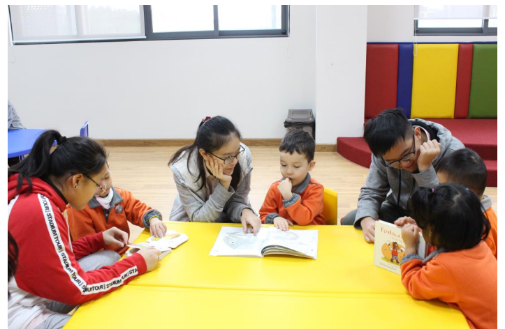
Our junior students were buddied up with the older students to form reading buddies.