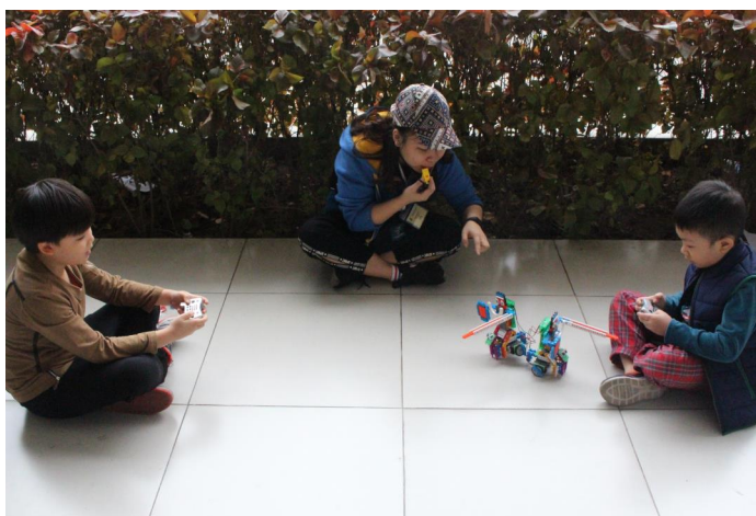
Robotics was offered and this fascinated the students