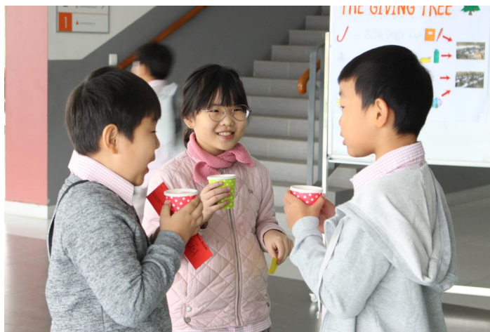
Students earned hot chocolate for "Catch me Reading"