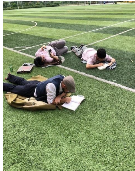
Reading is a valuable skills