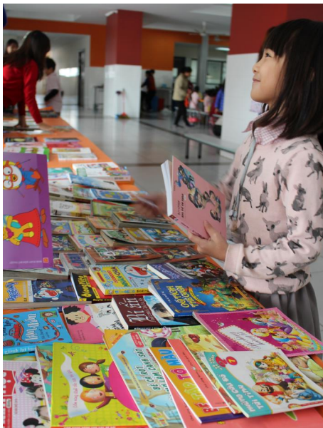
The book exchange was huge success