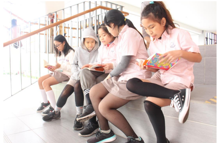
Our students were reading in and out of classrooms