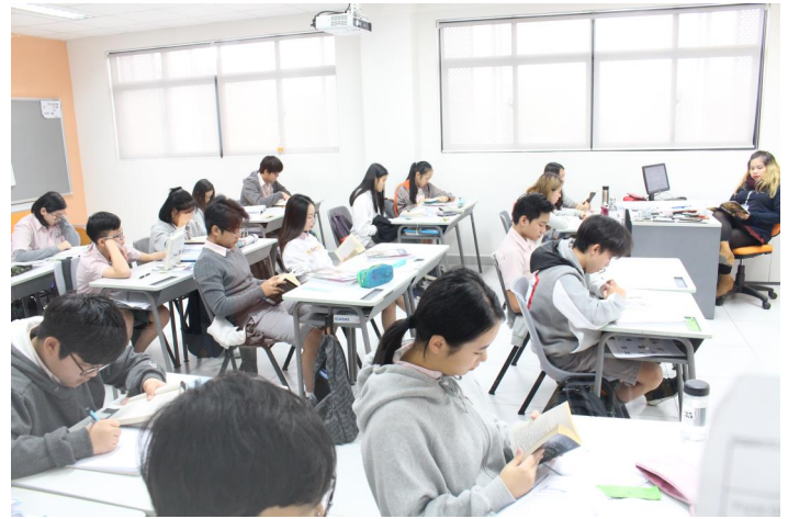
Students participated in D.E.A.R (Drop Everything And Read)