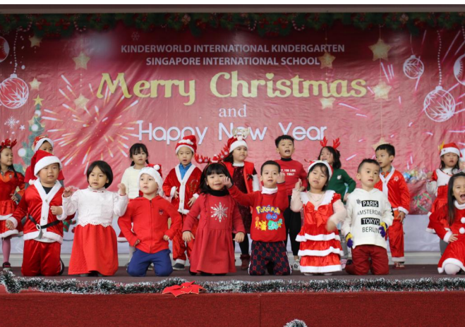
Prep students singing their Christmas song.