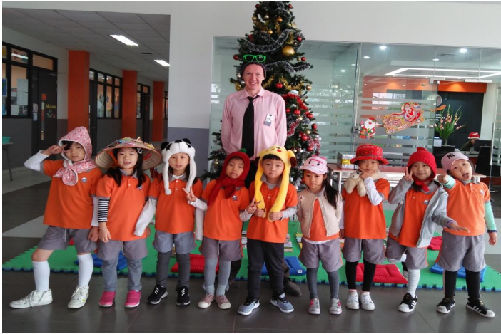
Our year 1 students participated in the "Hats Off" to Reading