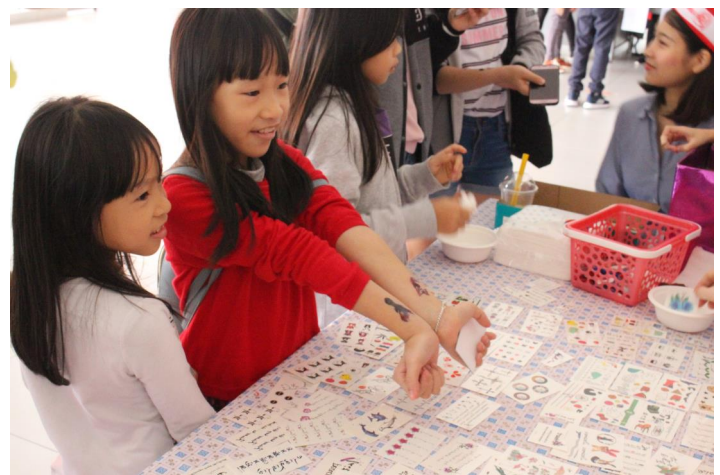
Students loved participating in the events planned by the classes