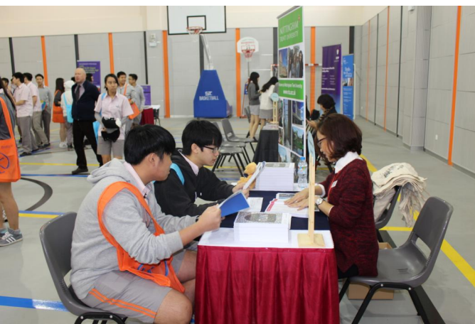
British University Fair