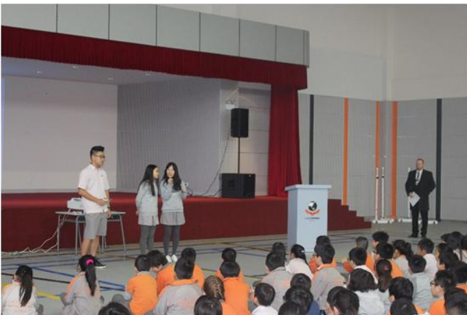
Students Presenting on Assembly