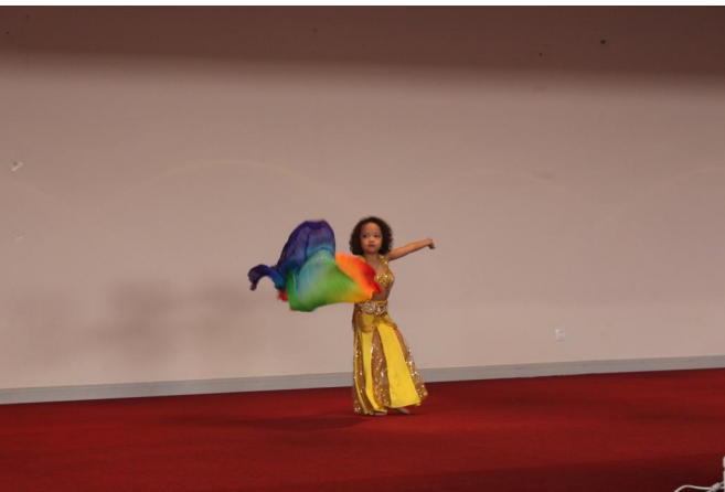
Year 1 Student Dancing