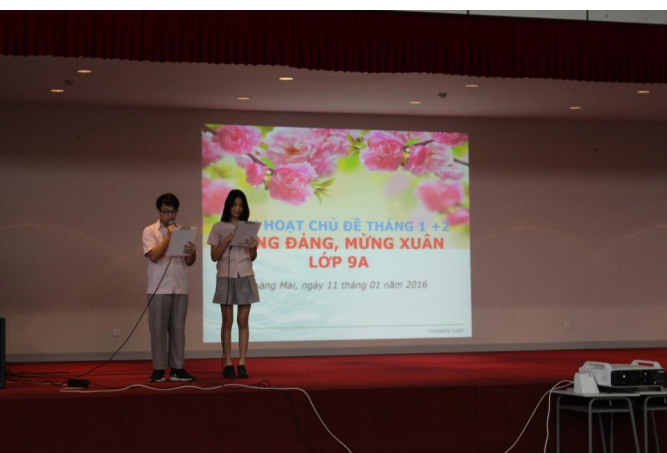
Vietnamese Assembly Presentation