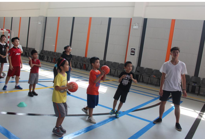
Primary students playing sport with High school