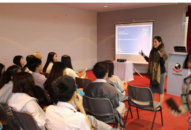
British University Fair Presentation