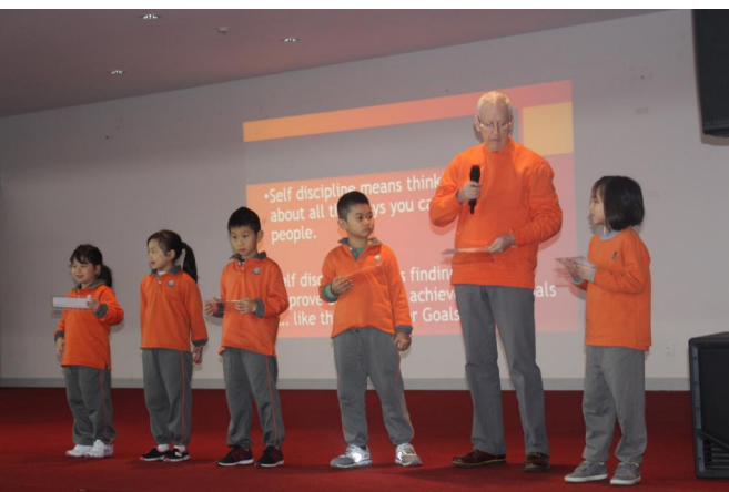
Primary students Assembly Presentation Year 2 Integrated