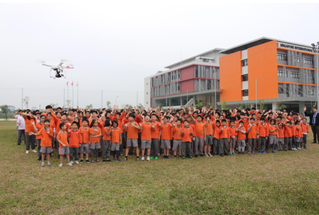
Whole school getting a photo taken