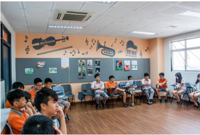
Students in Music Class