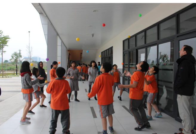
Outward Bound Activities