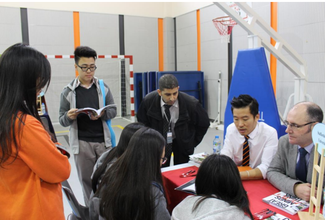
British University Fair