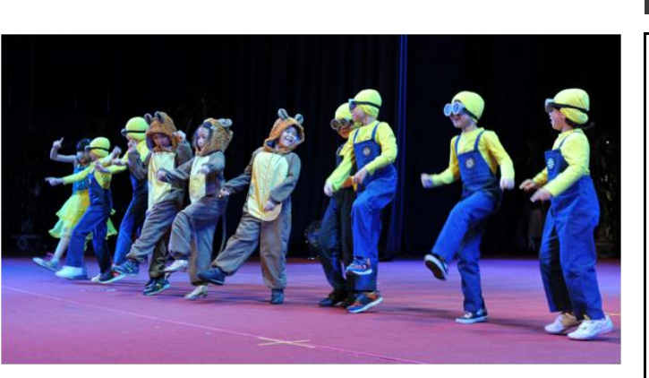
1A, 2A, 3A, 4A End of Year Concert Performance