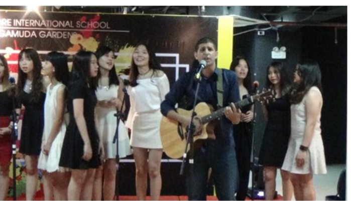
Night of the Arts celebration

As you spend quality time relaxing together, make an effort to talk about life and growing up, and how things have changed since your childhood days, and the noticeable differences of the world today; discuss current events and news and what's happening with the local community. Help to broaden their minds as a family.