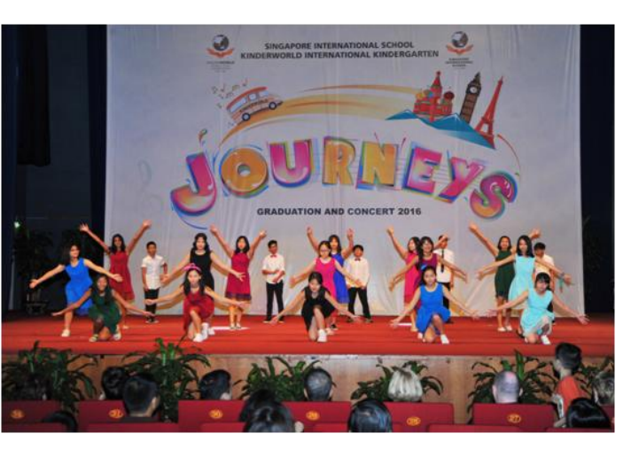
8LB End of Year Concert Performance