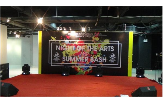
7th Annual Night of the Arts