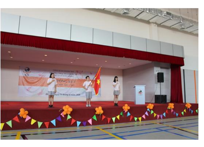
SVIS End of Year Graduation

Gamuda Gardens 2 Road, Gamuda Gardens, Km 4.4 Phap Van, Hoang Mai District, Hanoi City Tel: (84-4) 66661818 Fax: (84-4) 62620639