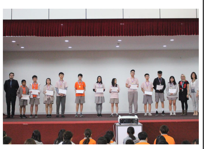
Proud Spelling Bee winners