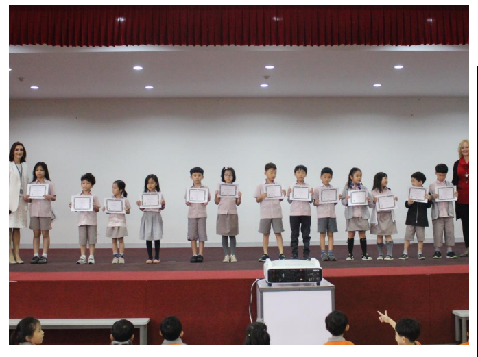
Our Primary School students are proud recipients of the Merit Awards