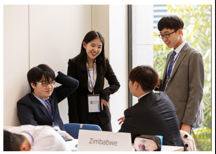
Students debating and discussing events