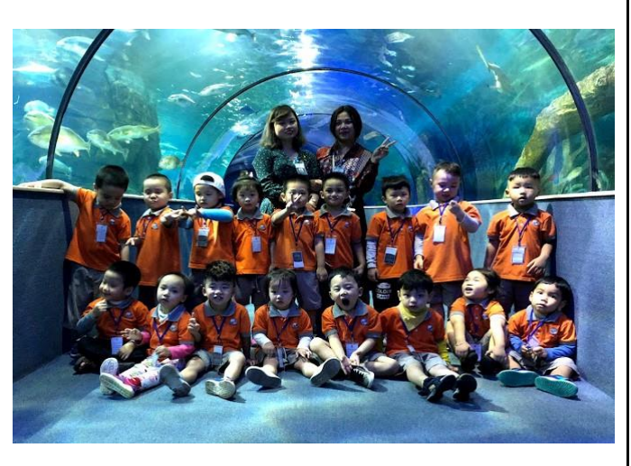
Our KIK students visiting the aquarium