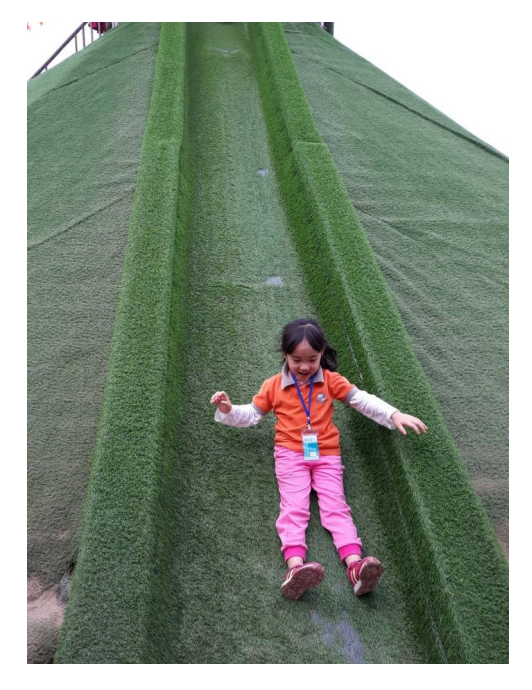
KIK student enjoying their excursion