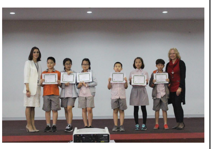
Students are proud recipients of the Merit Award.