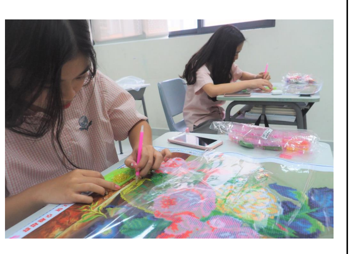
Students participating in a Club of their choice