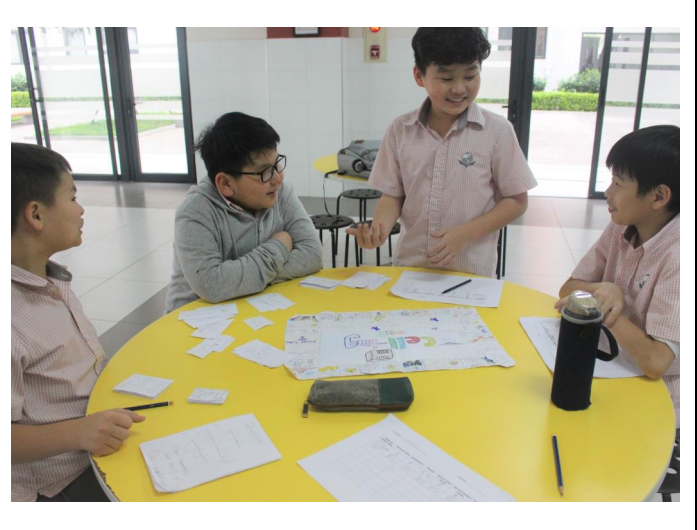
Our year 6 international boys doing some awesome STEM group work