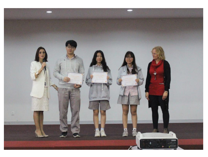
Students achieved all the Schoolwide Learner Goals to receive a Global Citizen award