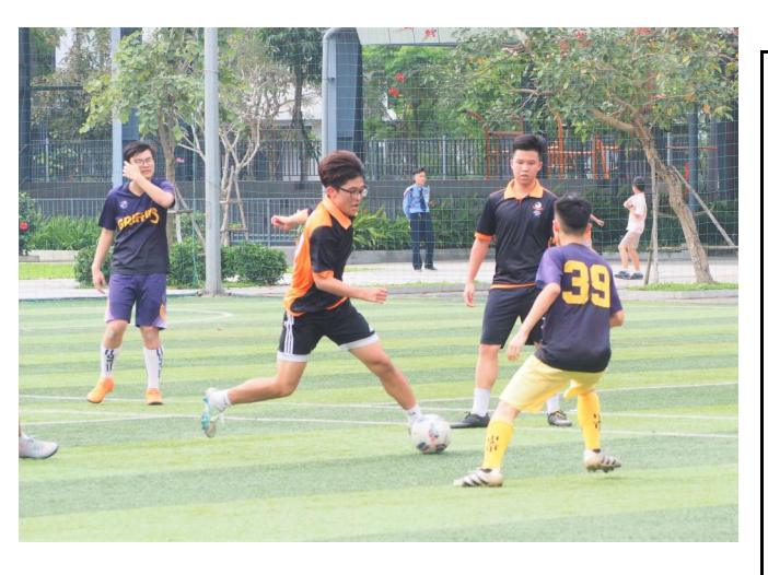
Another solid victory for the SIS football team. Well done on a fantastic year!