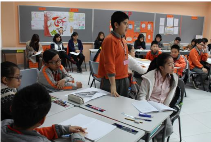
Spring Teaching Contest