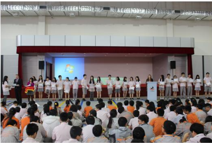
Students receiving academic merit award