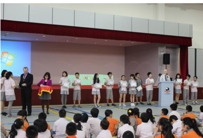
Students receiving academic merit award