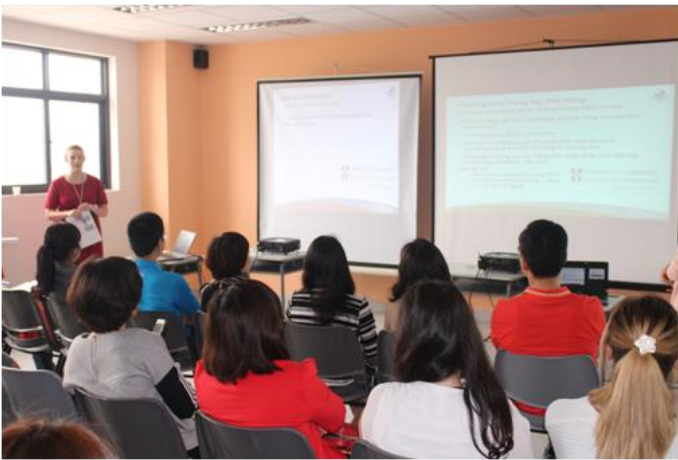
High School information session

Teachers supporting children is the focus of our work here at SIS. Parent support for children's learning is just as important and we encourage you to spend time helping your child with homework and assignments. There is an old saying that "a parent is a child's first and No 1 teacher." Abundant research tells us over and over again that parents need to set the example. The message is – read! Love books! Know about books! Share books! Nothing we do as teachers and parents is more potent than the example we set. If we show our children that we genuinely love to read, our passion for knowledge and reading will shine through and inspire our kids. As adults we provide the model.