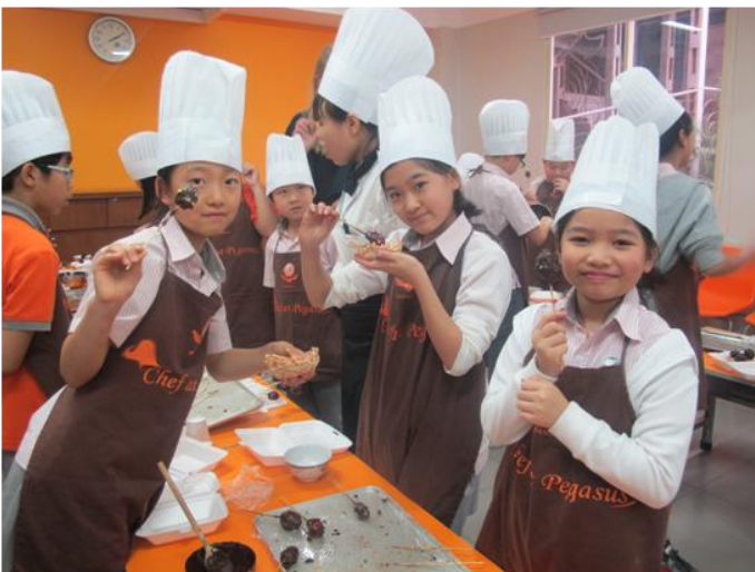
Students making Easter treats at PIC