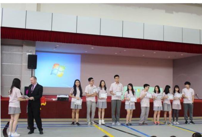
Students receiving academic merit award