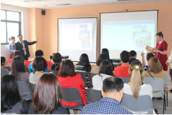
High School information session