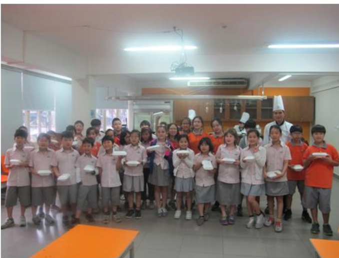
Students making Easter treats at PIC