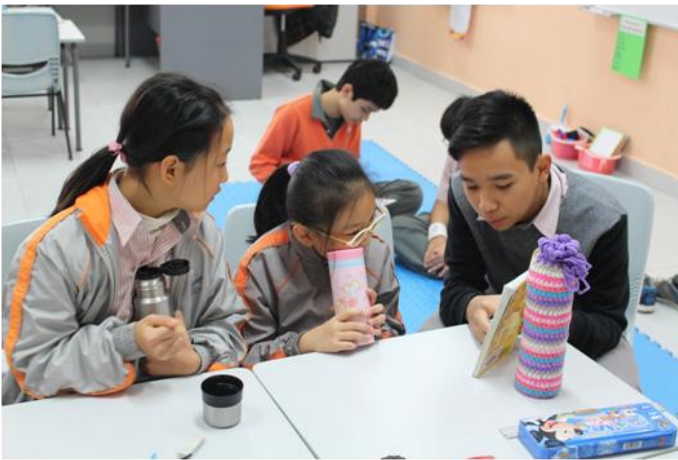
Senior student reading book for junior students