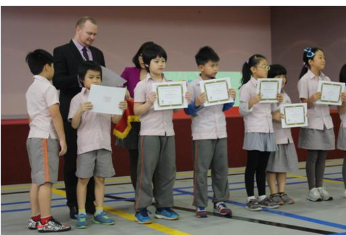
Students receiving academic merit award