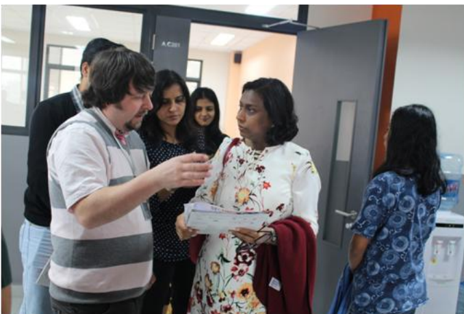
High School information session