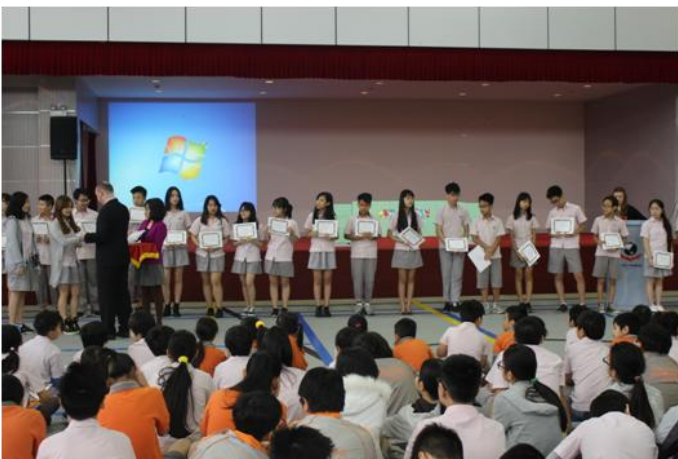
Students receiving academic merit award