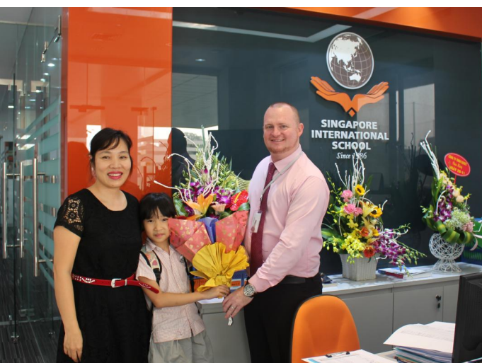
Teachers' Day flowers from parents