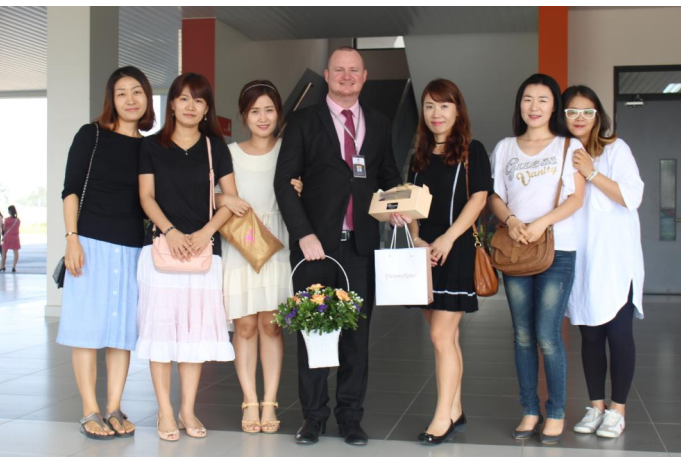
Korean Mom's presenting gifts for Teachers' Day