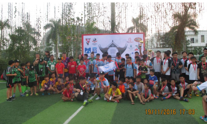
Gaelic Football Club