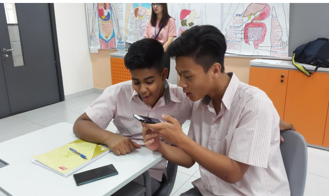
Students participating in STEM lecture