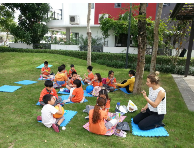
Year 2A and 3L excursion

Once again, I wish you all good health, success and happiness! Good luck to my students in the Semester 1 exam and have fruitful results!