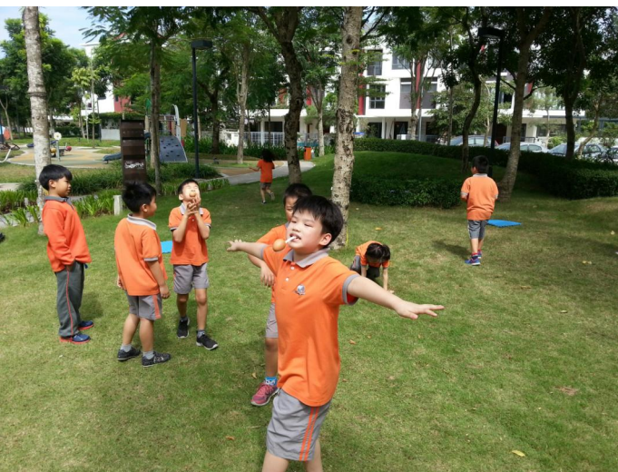
Year 2A and 3L excursion