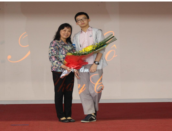
Flowers from student for Teachers' Day