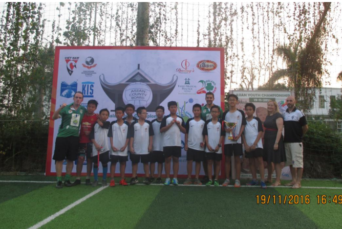
Gaelic Football Club