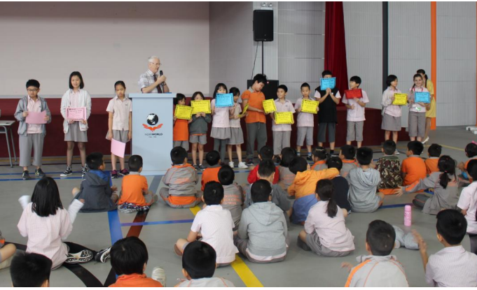
Students receiving certificates during Primary School Assembly