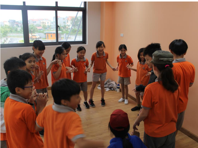
Students participating in OBV activities