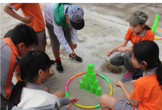
OBV team building activities.