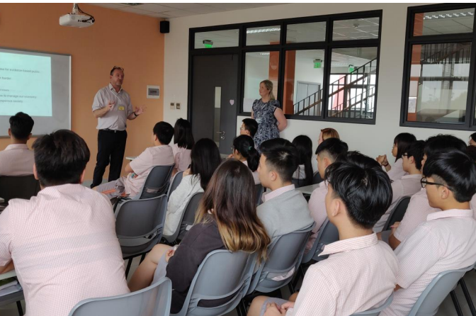
Presentation from the University of Melbourne for our GAC and A – Level students