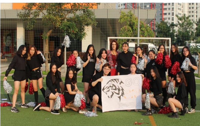
Our first ever cheerleading team with our Principal