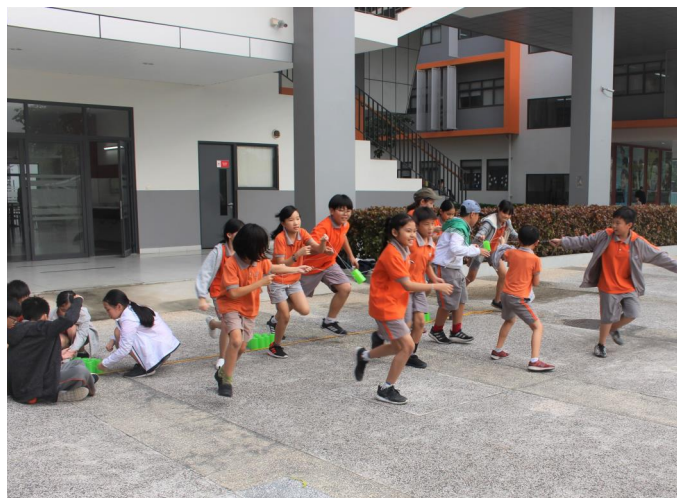
OBV activities continuing

November also had a special day, November 20th, where Vietnamese society displayed honour and show their gratitude towards teachers. Our teachers have spent many hours in attempting to cultivate and nurture the love of learning in our students. We would like to express our deepest gratitude to our parents and students for contributing fresh flower bouquets and several gifts with warm greetings to celebrate our 36th year anniversary of Vietnamese Teachers Day.