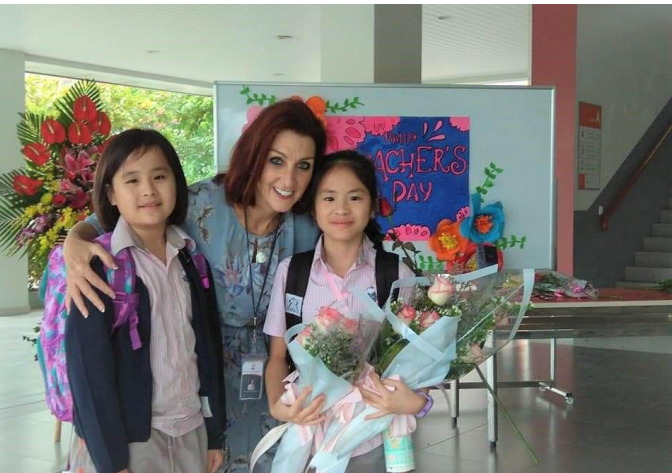
Our Principal with students in Teacher's day.