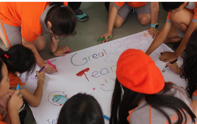
Students engaged in OBV activities.

Once again, we wish you always a healthy, happy and successful life. Have fun and joy in the process and students be prepared to enter the Semester One exam period confidently and thus receive excellent grades after your hard work.