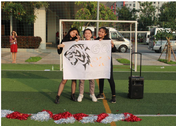
"SIS Tigers" cheerleading team coordinators