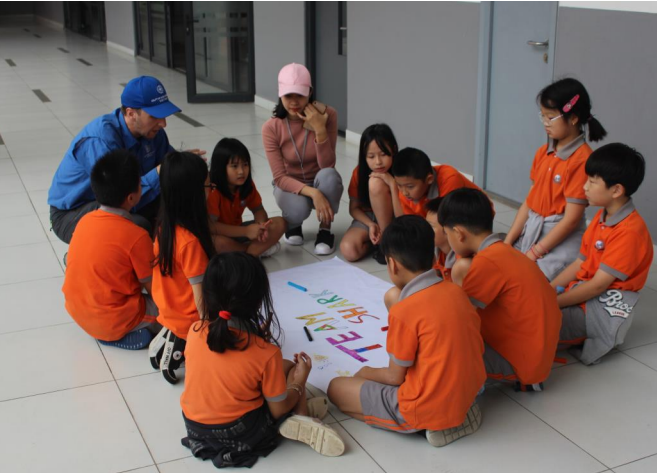
Our Year 4 students engaged in team building activities during the OBV program