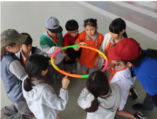
OBV activities were fun.