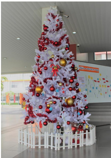
Our Christmas "Giving" Tree

The donations are given to Blue Dragon Foundation to purchase items for the underprivileged children.