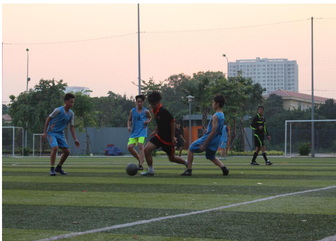
Our boys give of their best