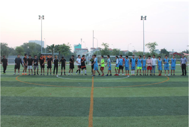
Our football team after a match against Hanoi Academy School,