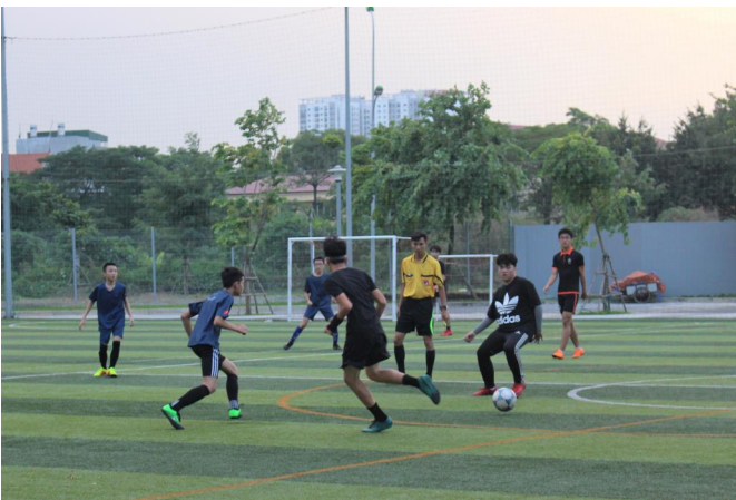
Students enjoying the match and displayed excellent skills.