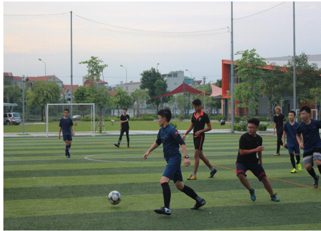
A football match between SIS and TH School