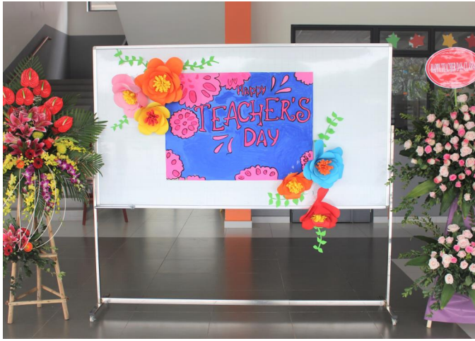
We enjoyed a wonderful Teacher's Day at SIS@Gamuda Gardens