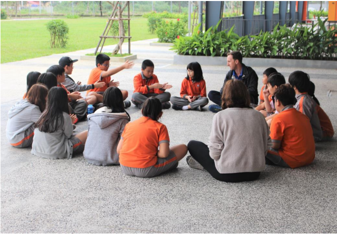
Students communicating and sharing ideas