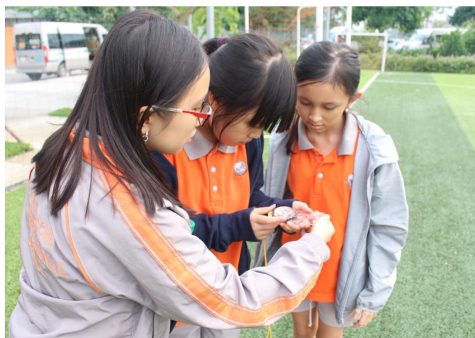
Student engaged in an OBV activity.