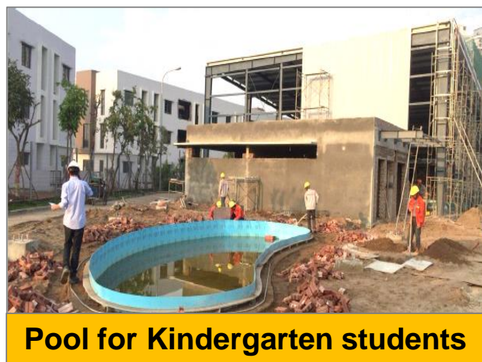
Pool for Kindergarten students