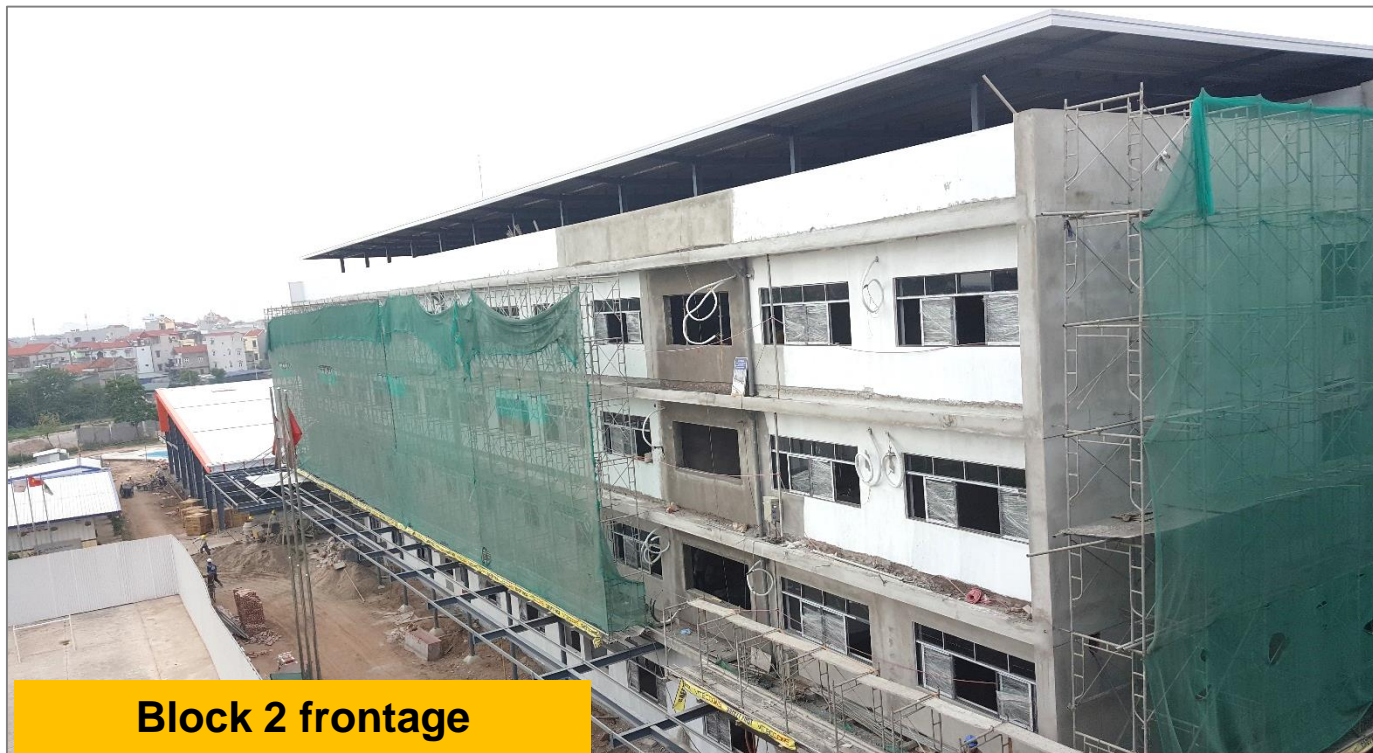
Block 2 frontage