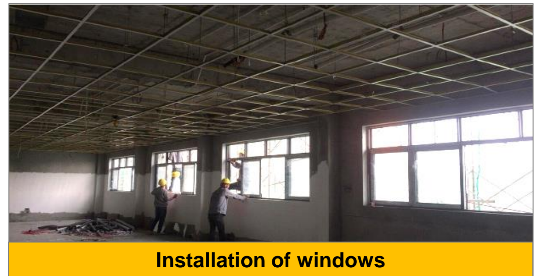
Installation of windows