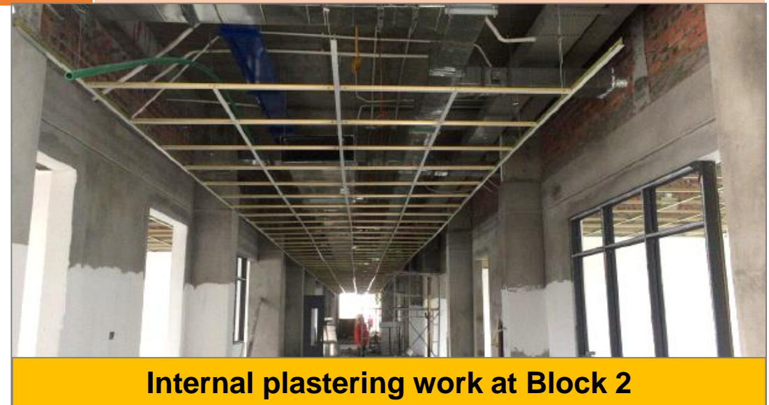
Internal plastering work at Block 2