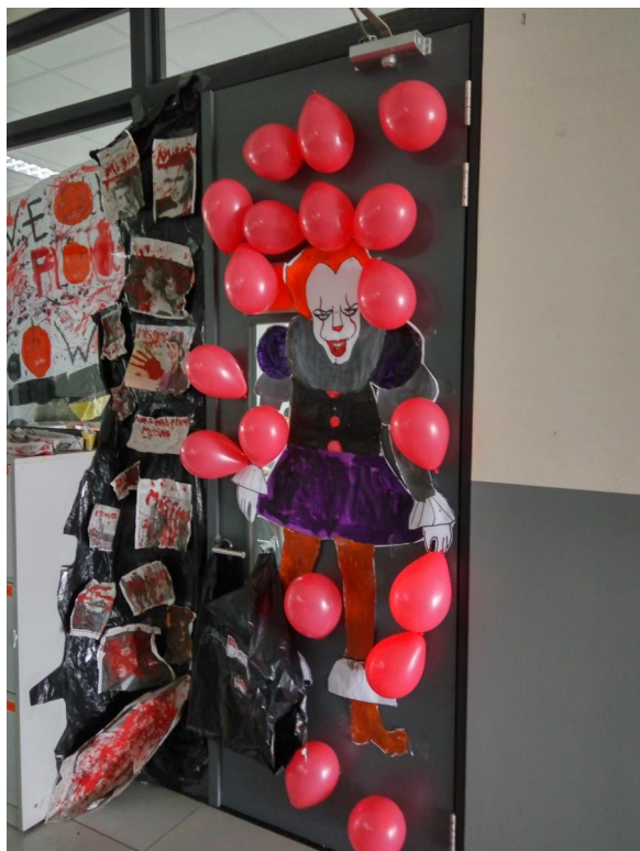
Halloween Door Decoration