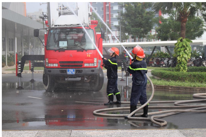
Fire Drill Practice with Hanoi Fire Safety Department