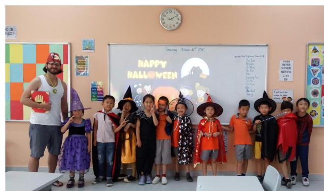
Year 1L students dressed up for Halloween

There is one special day in November which is Teacher's Day. It is a special day when people show their gratitude to teachers – those who silently contribute to education. We would like to thank you sincerely – parents and students – for your beautiful flowers and cards full of nice words and wishes, on the occasion of the 35 th anniversary of Vietnamese Teacher's Day!