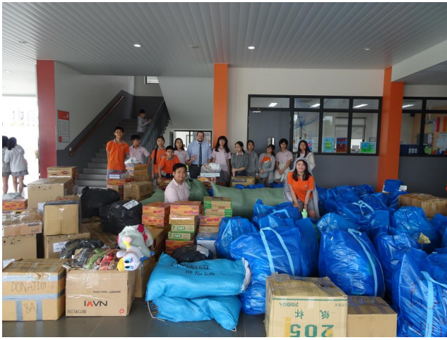
Niem Son charity donations ready for delivery