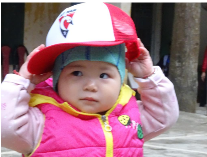
A child from Niem Son receiving donations