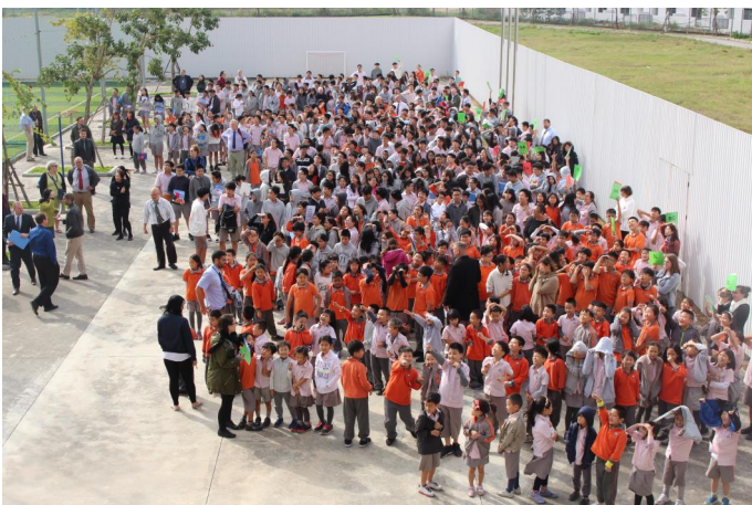
Fire Drill Practice