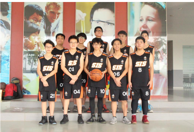
Senior Boys Basketball Team