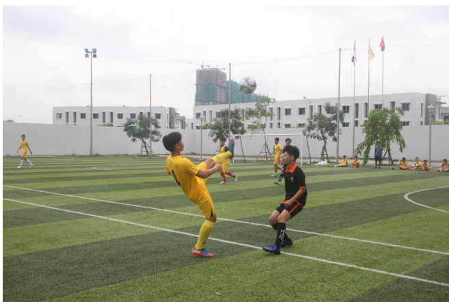
SIS playing football with Olympia School