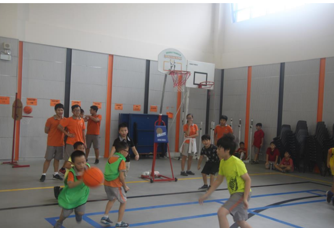
Primary students playing basketball