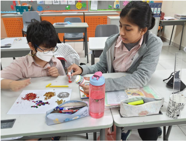
Our students enjoyed decorating and creating interesting Easter eggs