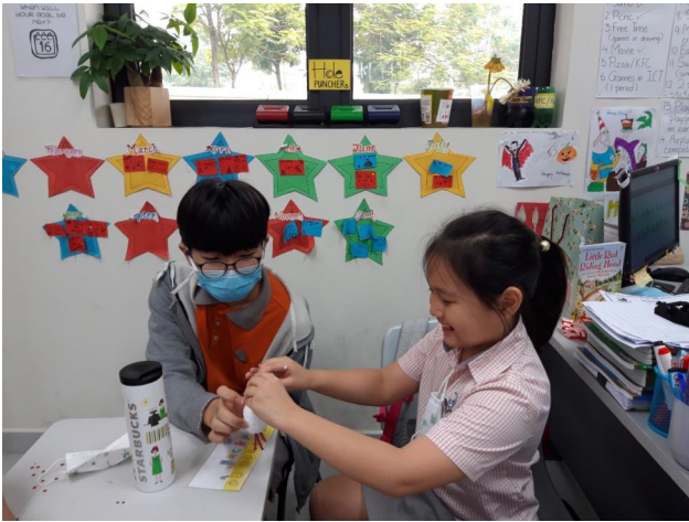
Great friendships and trust amongst students is formed