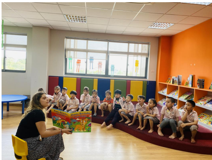
Story time in KIK is such a fun event!