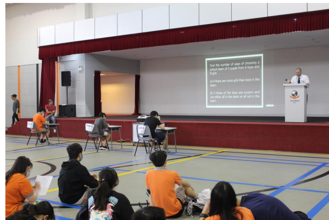
A Math Challenge was enjoyed by our High School students