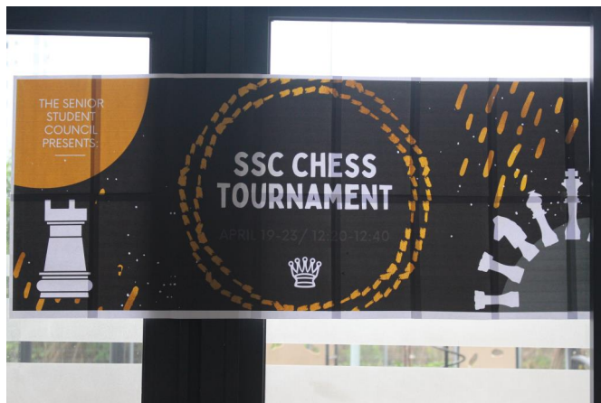
Our Student Council organized a Chess tournament for our students