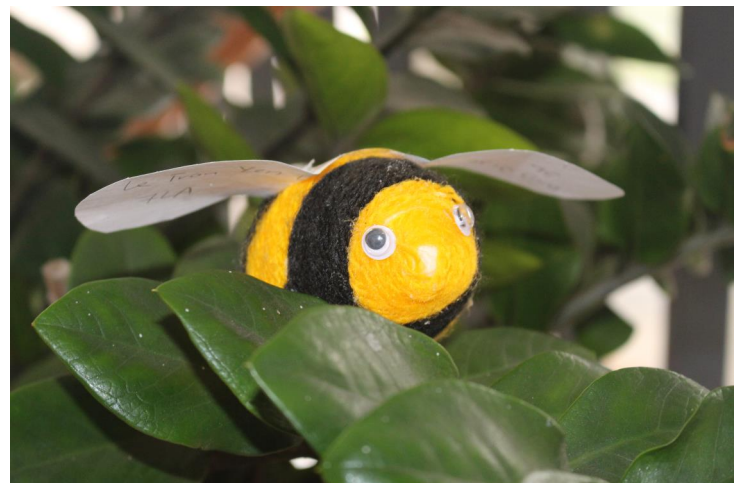
Le Tran Yen Vy 7LA - Bang Ji Yoon 3L