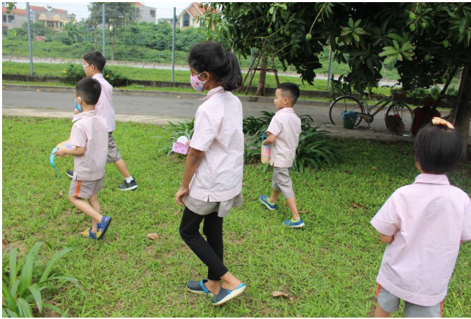
Our students loved the Easter Egg Hunt