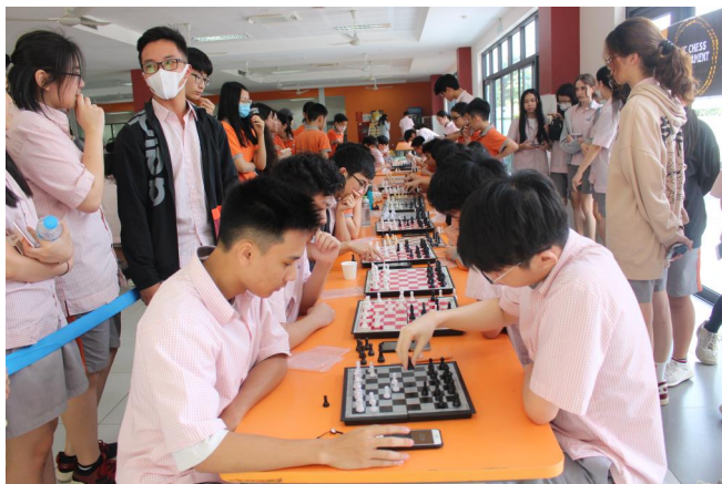
The competition was tough!