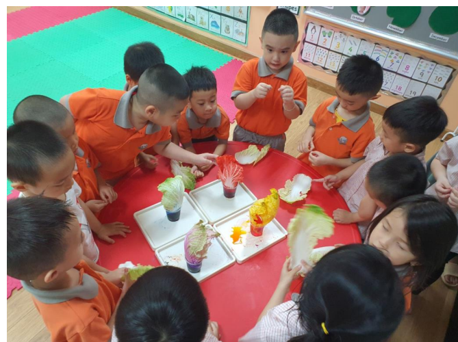
Our students participated in STEM activities