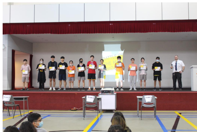
The Top Math winners!