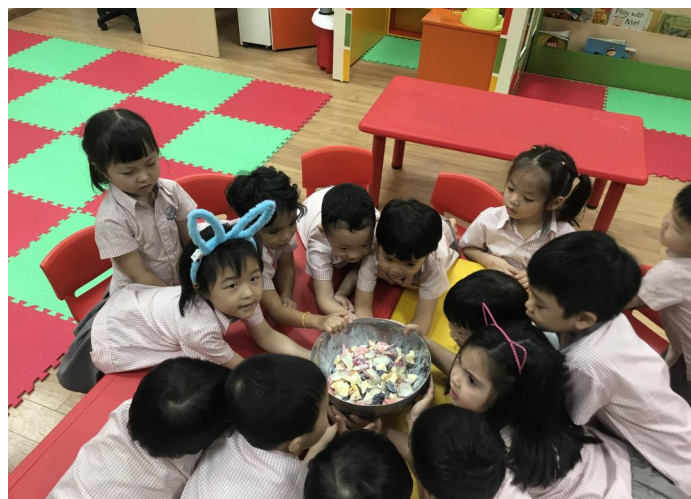
Our KIK students enjoying making salad