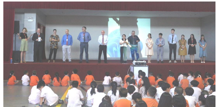
NEW STAFF SY 2023-2024