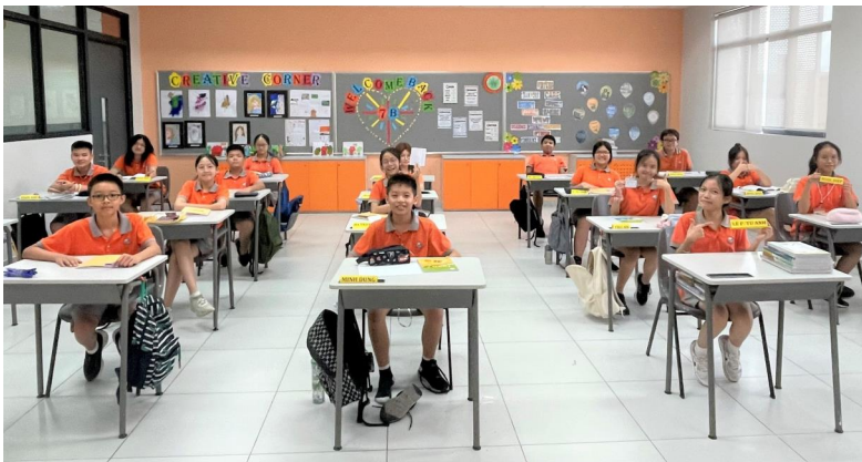
WELCOME BACK TO SCHOOL

Singapore International School @ Gamuda Gardens