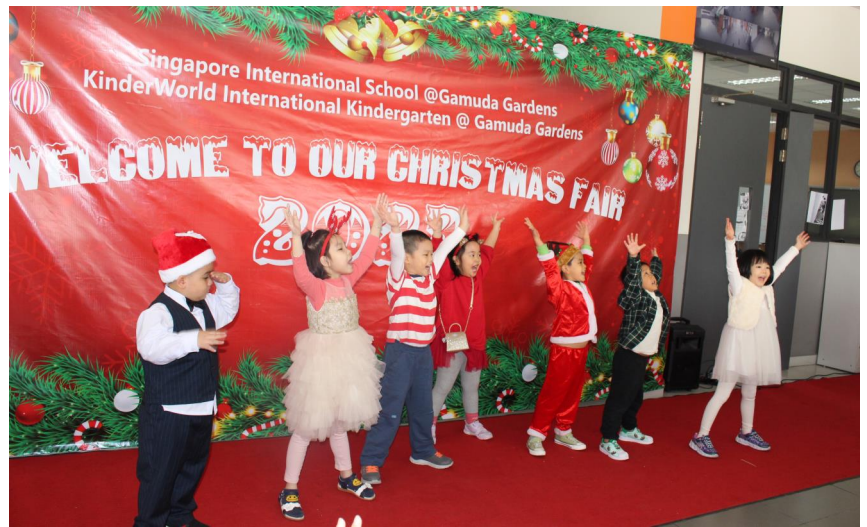
Santa's little Helpers