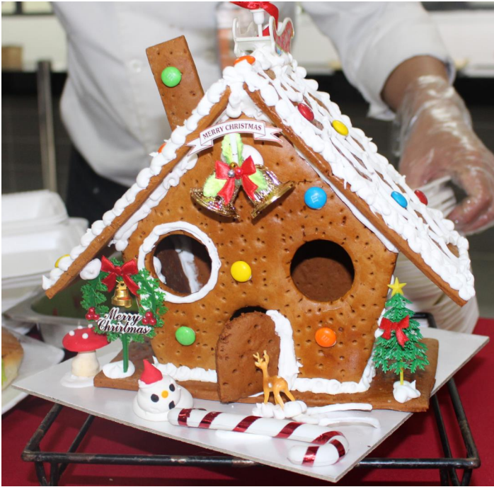
Ginger Bread House