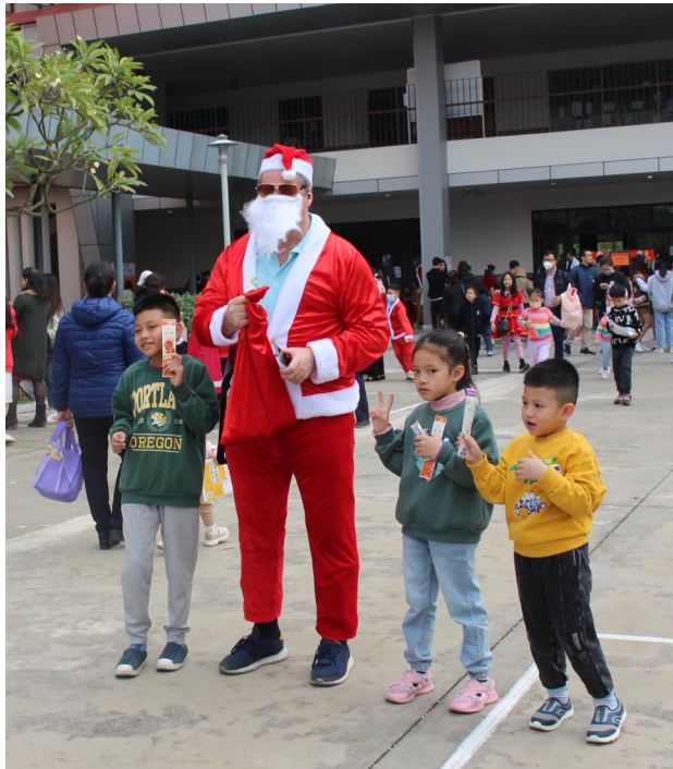
Santa Claus is coming to town

Singapore International School Gamuda Gardens.