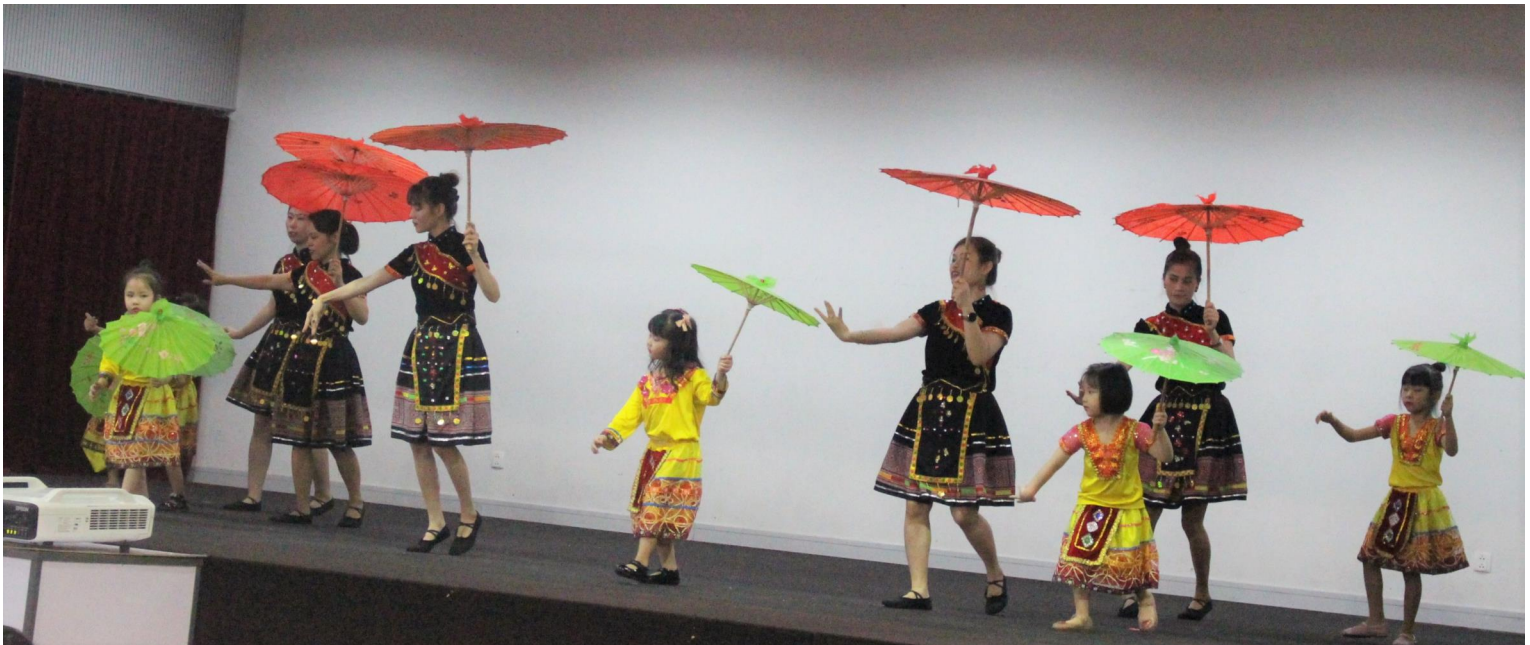
TALENTED KIK STUDENTS & STAFF