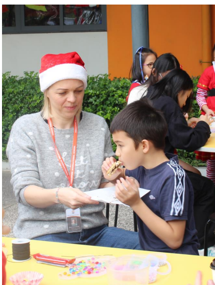
It tastes like Christmas