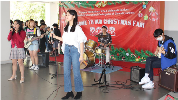
SIS Student Band