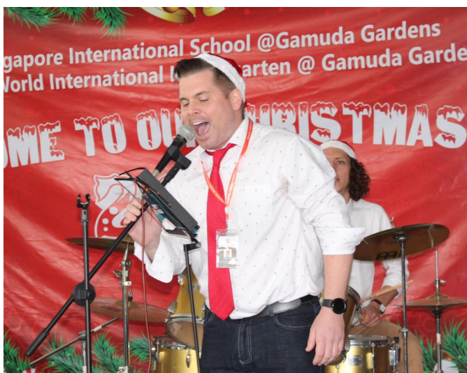
SIS Staff got in the Christmas spirit