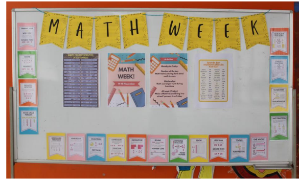
SIS Math Week!