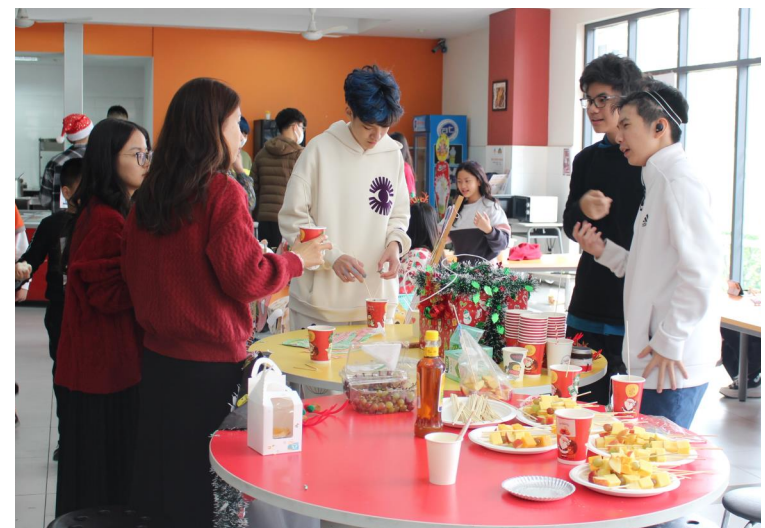
SIS Business students know how to negotiate