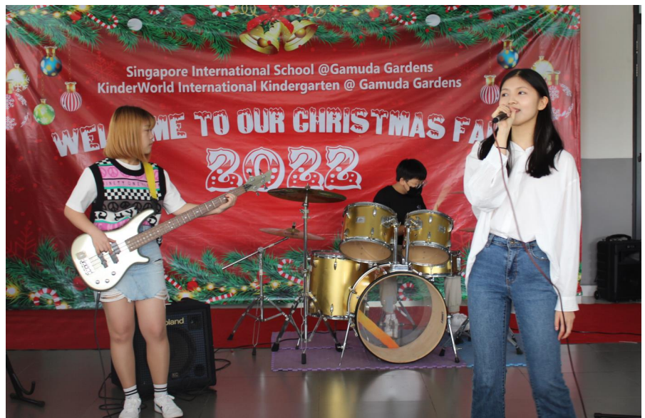
Jingle Bell Rock!