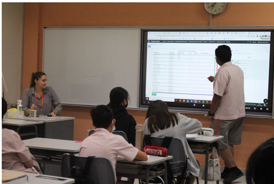
Teachers and Students interact with the Smart Board.