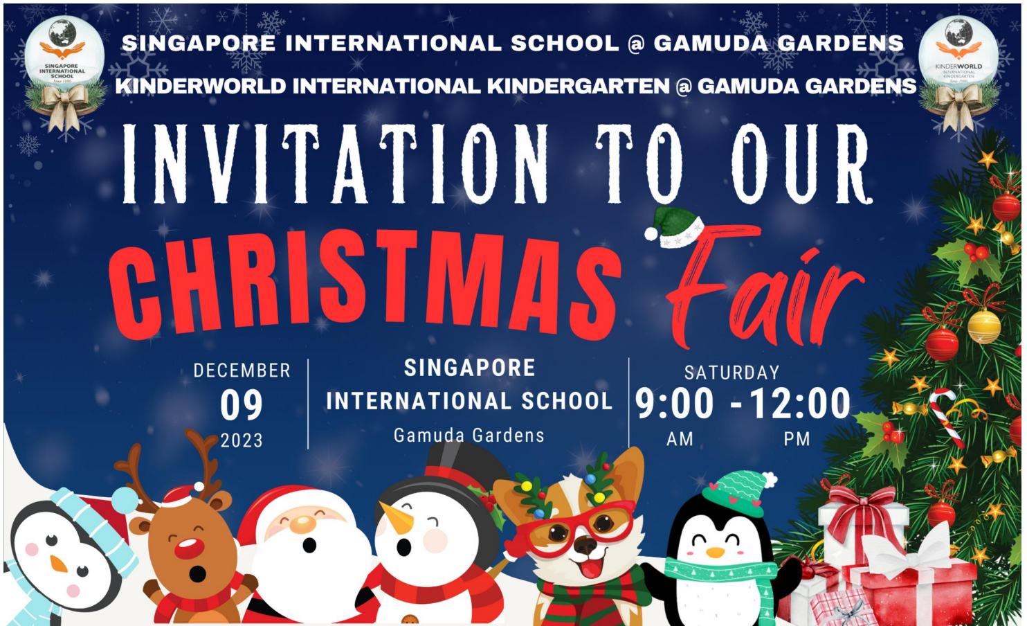
INVITATION TO OUR CHRISTMAS FAIR