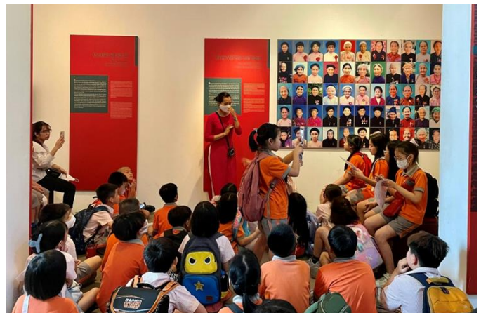
Students Y4,5 listen carefully the stories about Vietnamese Women