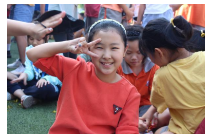
Primary Sports Day