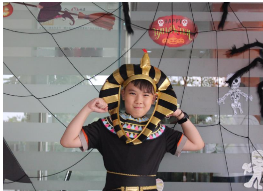
Ramses The Great!