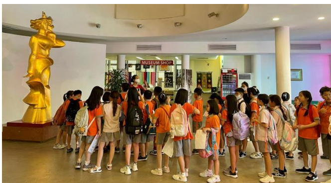
The Excursion to Vietnamese Women Museum of Students Y4,5