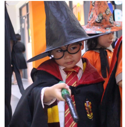
You are a Wizard Harry