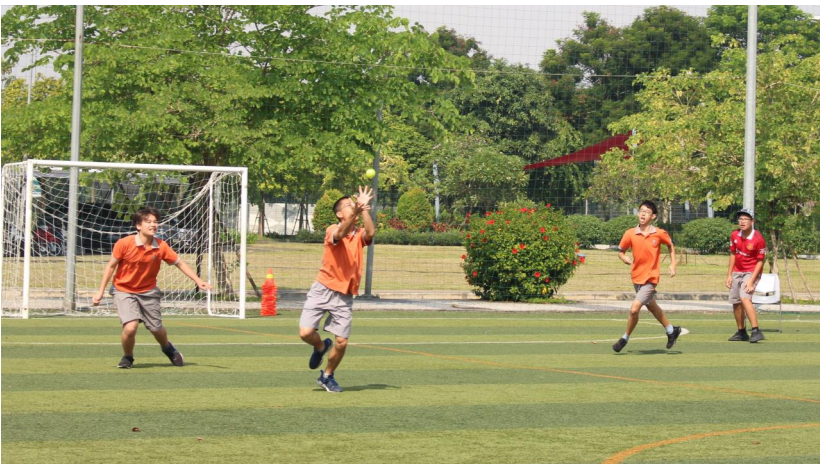
The pressure builds in the field