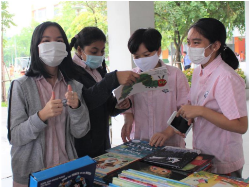
Books can make you smile!