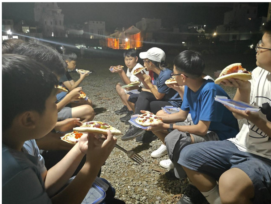
OBV Pizza in style