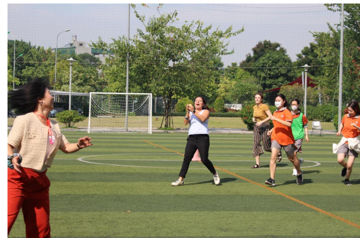
The Teachers in Action vs Students