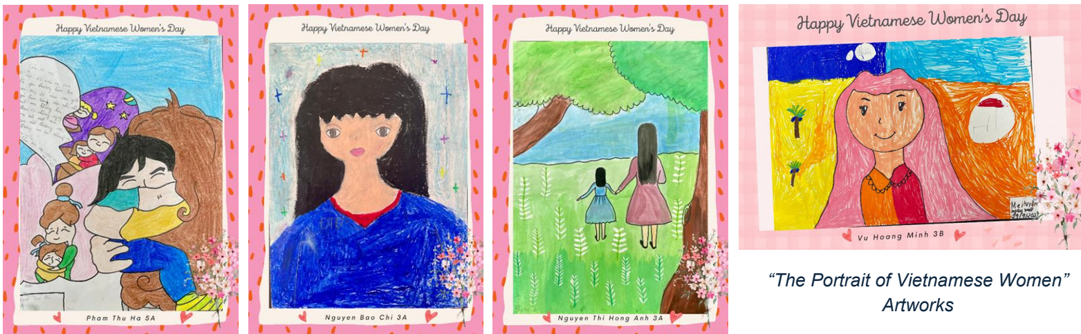
"The Portrait of Vietnamese Women" Artworks