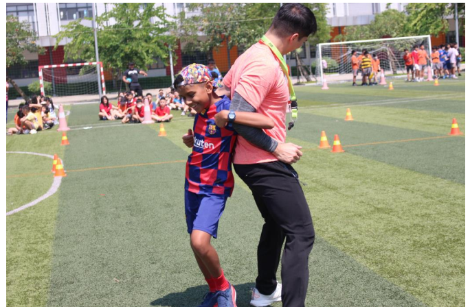
A Battle of Strength!