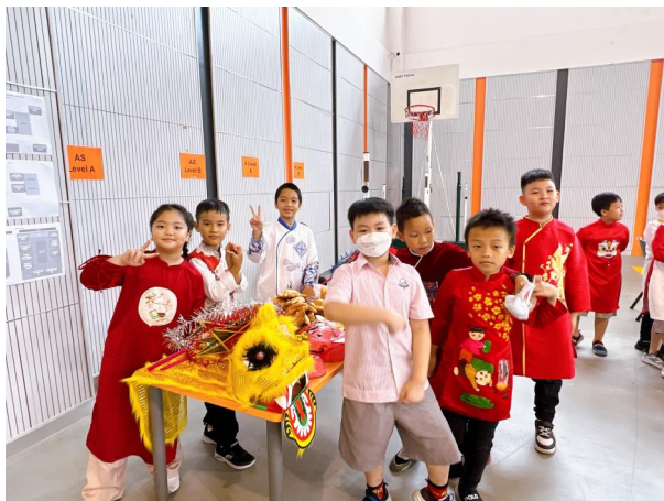
Mid-Autumn Festival Activities