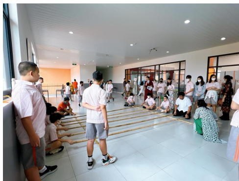
Mid-Autumn Festival Activities