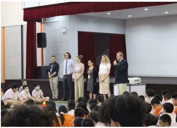
New Heads of Study