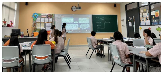
Y4 students confidently organize activities for classmates