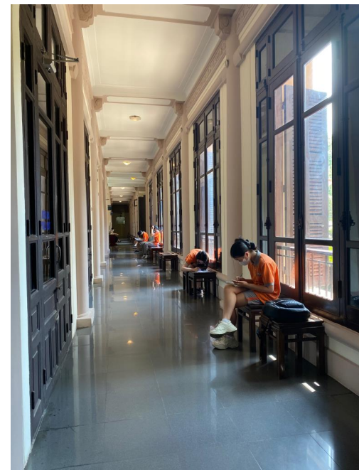
Excursion to the Hanoi Fine Art Museum