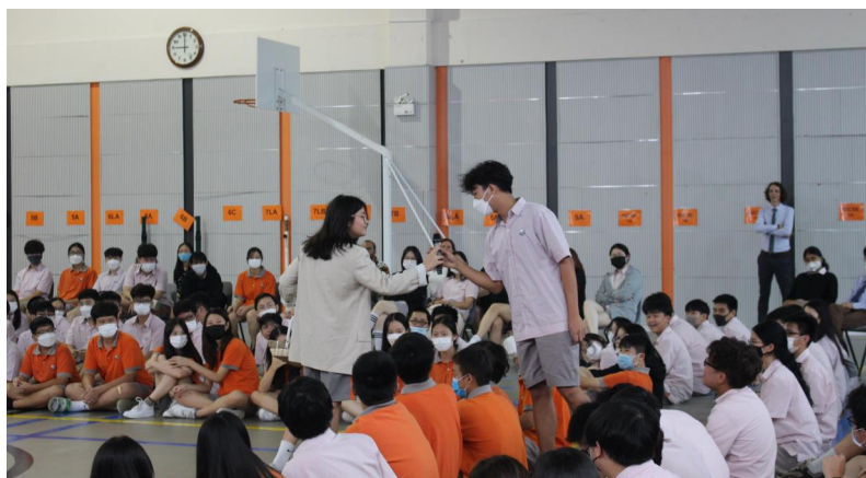
Assembly for Secondary and High school students