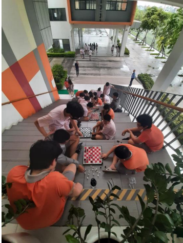
Phone Free Friday