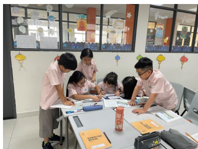
Y4 students passionately prepare their reports