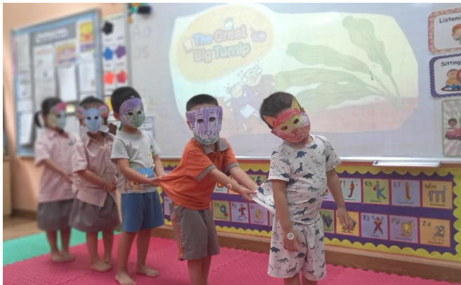
"THE GREAT BIG TURNIP" - ROLE-PLAY