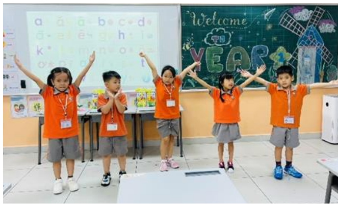
THE FIRST LESSONS FULL OF EXCITEMENT