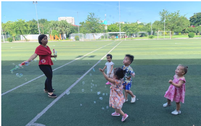
OUTDOOR ACTIVITIES - NURSERY CLASS