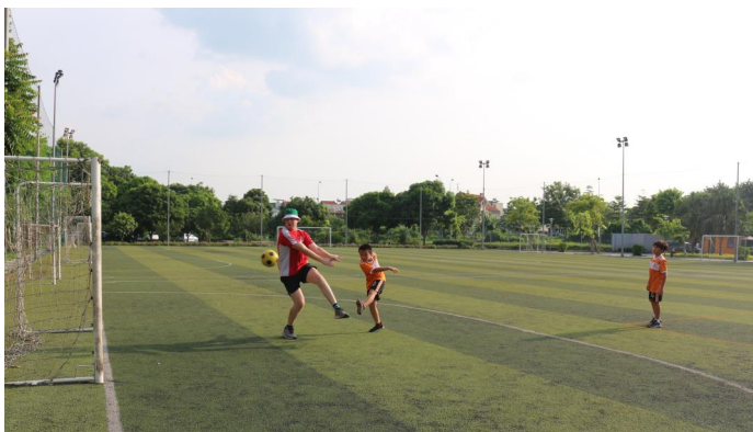
Gaelic Football Club