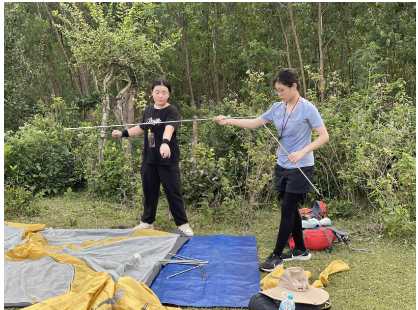
OUTDOOR TENT PITCHING