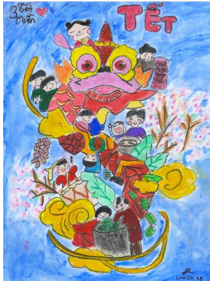
PHAM LE LINH CHI 5B