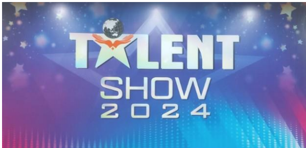
SIS GOT TALENT SHOW 2024

continued collaboration in making the school experience for both our current and future students a great one.