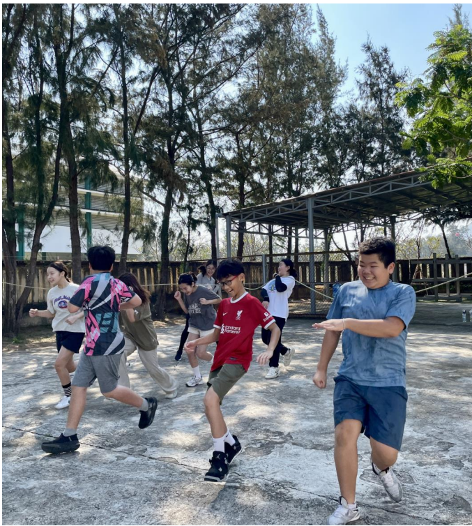
ROPE JUMPING CHALLENGE