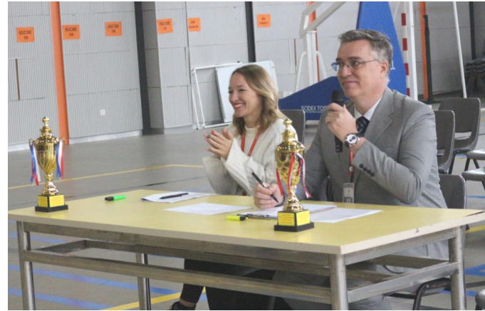
JUDGES OF SPELLING BEE PRIMARY