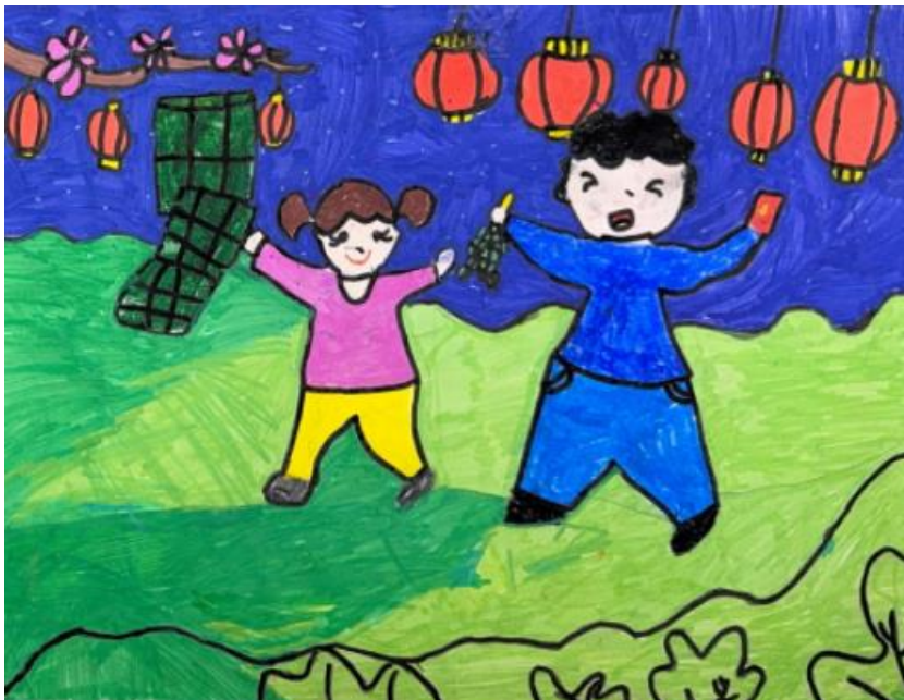
NGUYEN NGOC HUYEN 1B