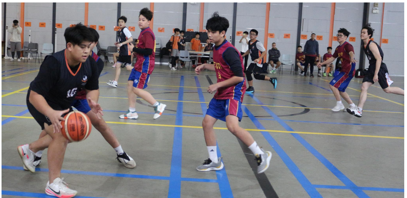
HANOI SPORTS LEAGUES BASKETBALL GAMES