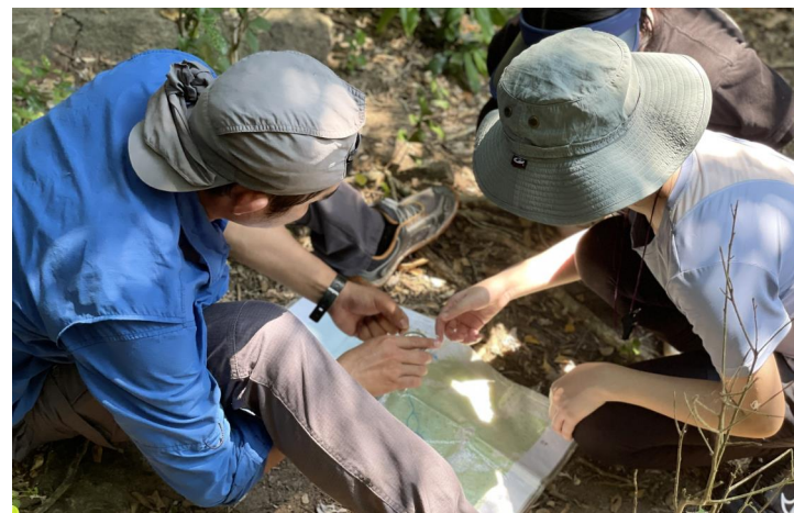
NAVIGATION & ORIENTATION CHALLENGE