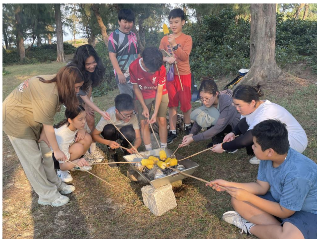
OUTDOOR COOKING EXPERIENCE