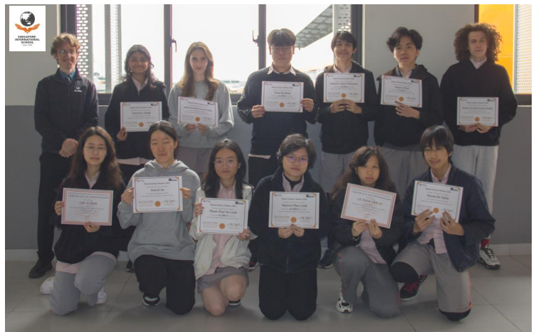
HANOI SCIENCE DEBATE TEAM 2024