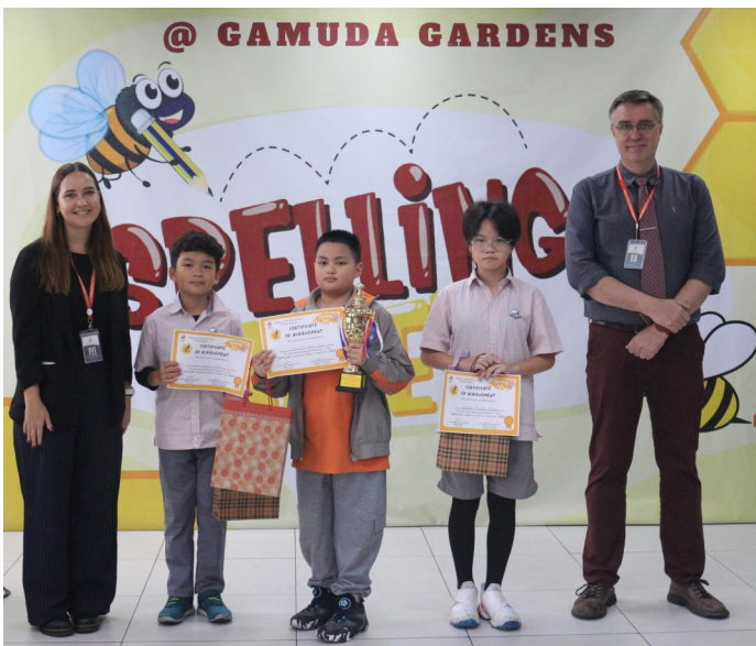
CONGRATULATION TOP 3 OF PRIMARY INTERNATIONAL CLASSES