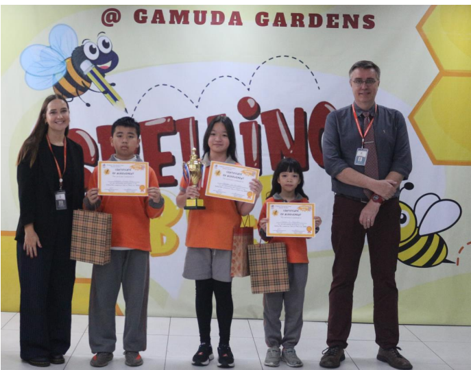
CONGRATULATION TOP 3 OF PRIMARY INTEGRATED CLASSES