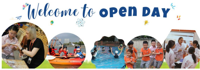
OPEN DAY 23 MARCH 2024