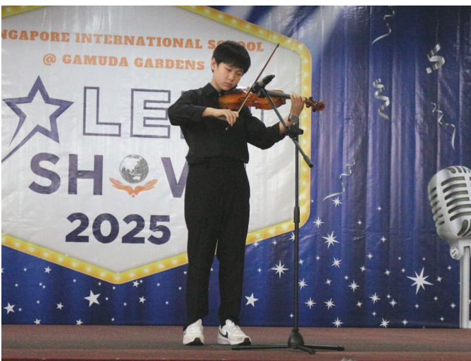
SIS GOT TALENT 2025'S PERFORMANCES