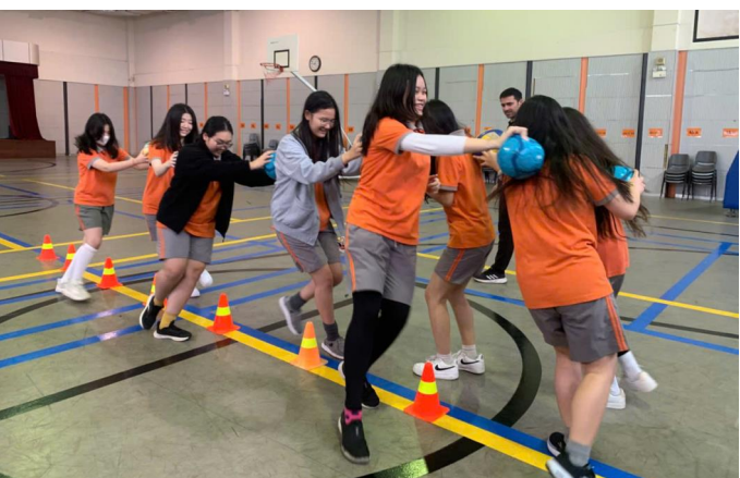
HPE LESSONS - WARM UP