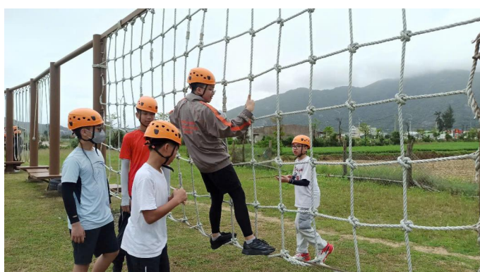
YEAR 7 INTERNATIONAL OBV EXPERIENCE - BINH DINH PROVINCE