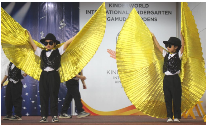
SIS GOT TALENT 2025'S PERFORMANCES