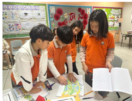
THE PATH-FINDING CHALLENGE