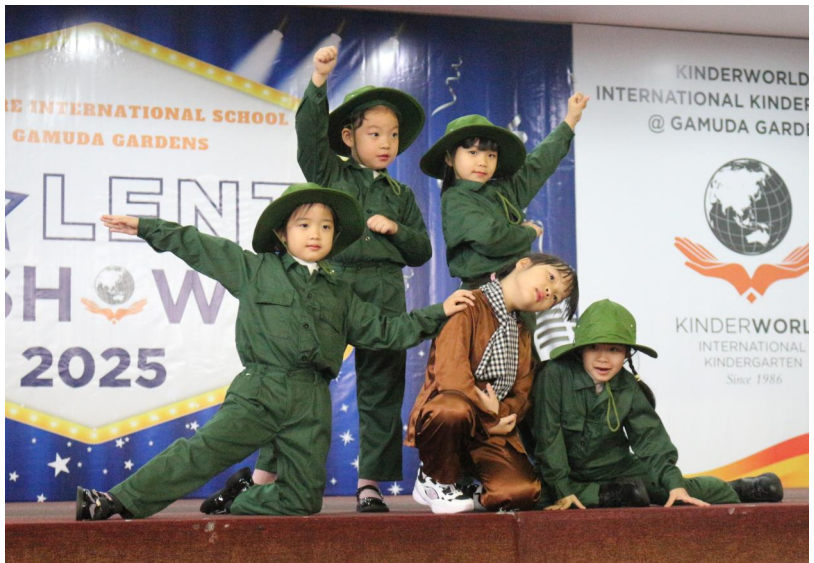
PREP STUDENTS' PERFORMANCE AT SIS GOT TALENT 2025