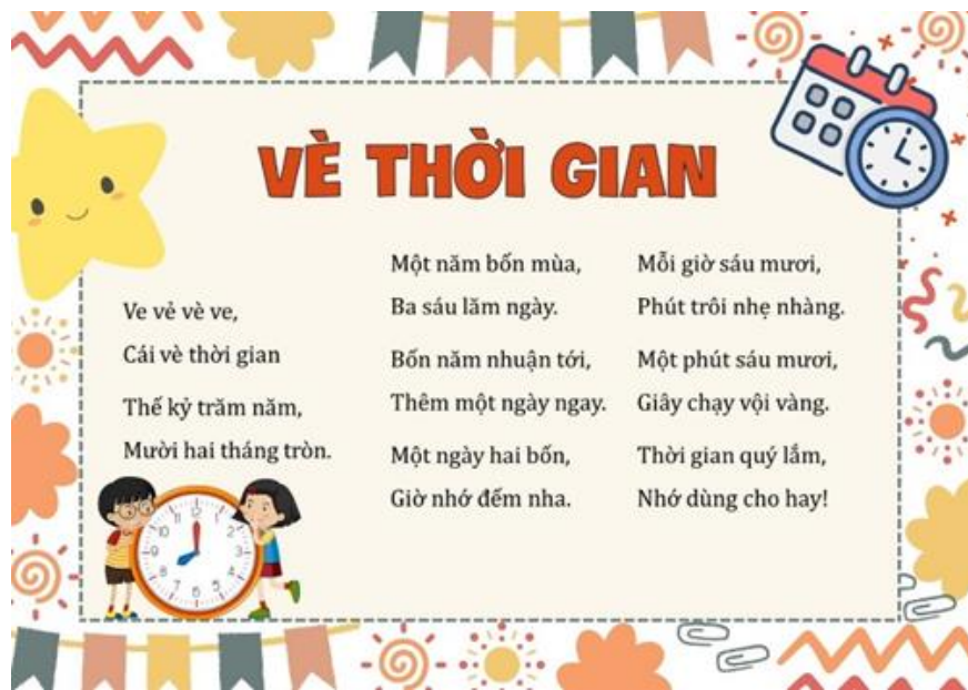
A CREATIVE MATH CHANT PERFORMED BY OUR YEAR 5 STUDENTS