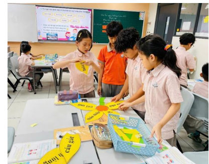
THE WORD FLOWER