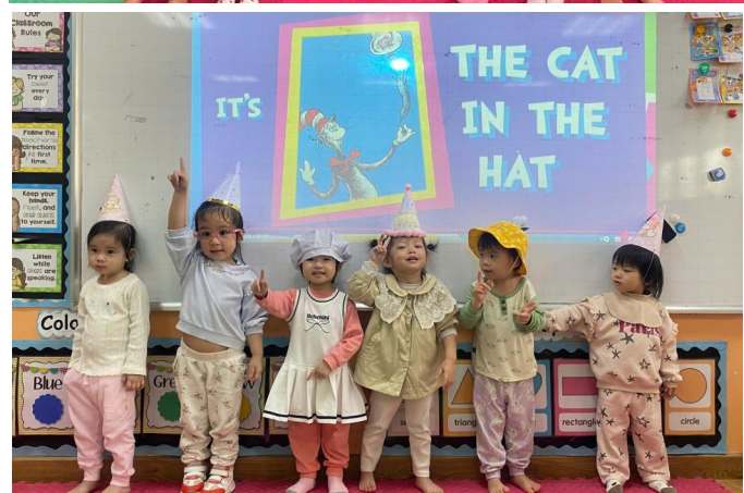
DR. SEUSS'S WEEK ACTIVITIES