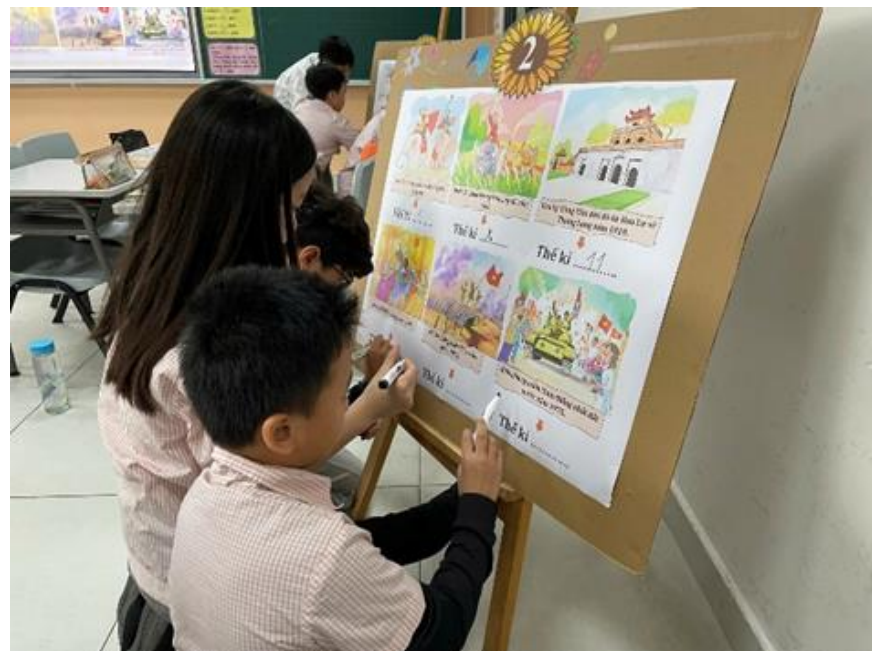
LEARNING MATH THROUGH HISTORICAL EVENTS