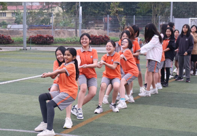
SECONDARY CROSS COUNTRY EVENT AND SPORTS DAY