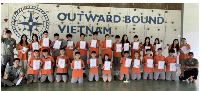
STUDENTS YEAR 7 INTEGRATED OBV EXPERIENCE - BINH DINH PROVINCE