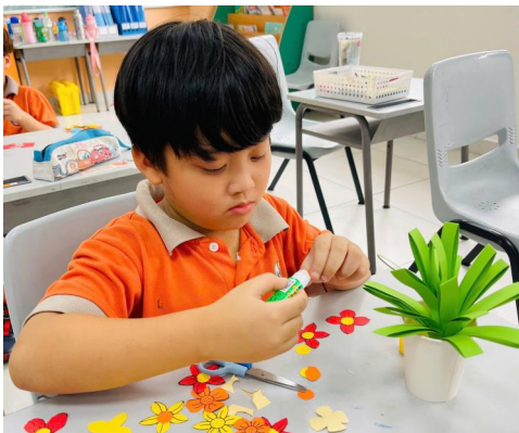
GIFT TO MOTHERS ON VIETNAMESE WOMEN'S DAY