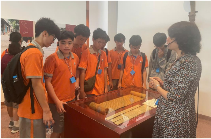
EXCURSION YEAR 7—8 INTEGRATED