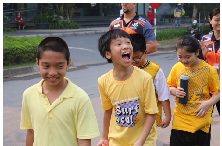
PRIMARY SCHOOL SPORTS DAY