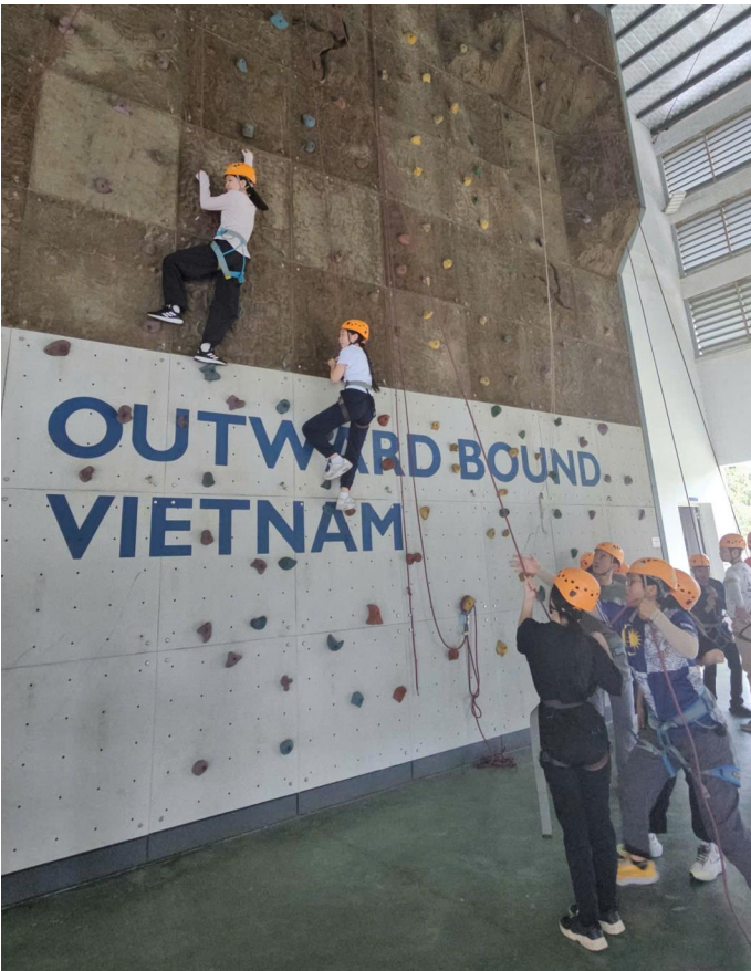
OBV YEAR 9 INTEGRATED