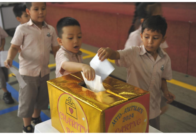
MID-AUTUMN FESTIVAL 2024 “CARING AND SHARING”