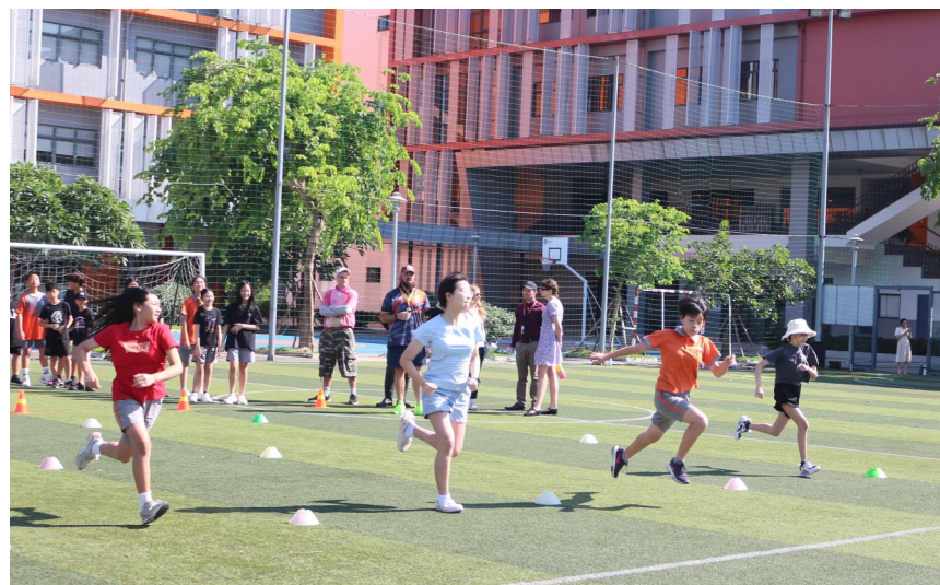
SECONDARY SCHOOL SPORTS DAY