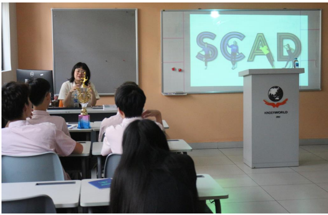
SESSIONS WITH SAVANNAH COLLEGE OF ART AND DESIGN (SCAD)