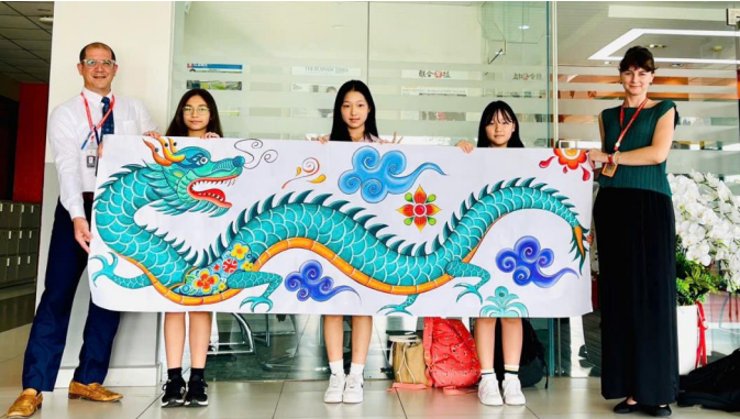
THE MID-AUTUMN DRAGON ARTWORK