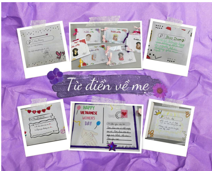
THE "DICTIONARY OF MOM" PROJECT